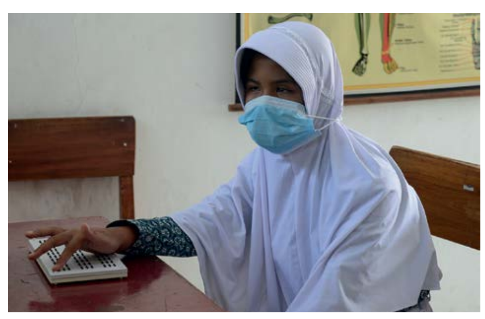
Student participating in a Braille lesson during the pandemic.

The institute's efforts to close the gap can be seen as part of a more general effort to disseminate clear and accurate information in Indonesia. Indonesia's Covid-19