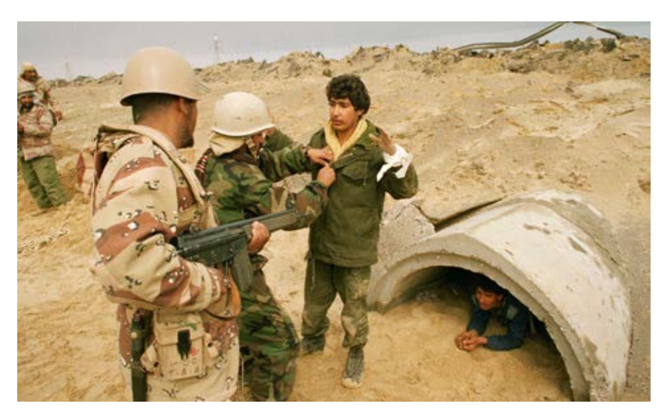
Iraqi soldiers surrendering in Kuwait in 1991.