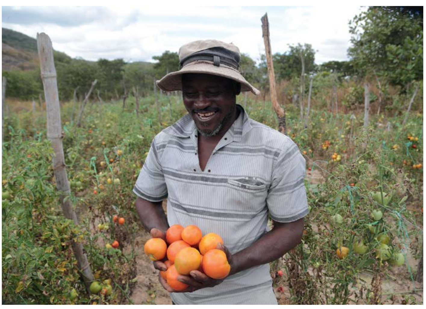
Small-scale farmer in Zimbabwe.