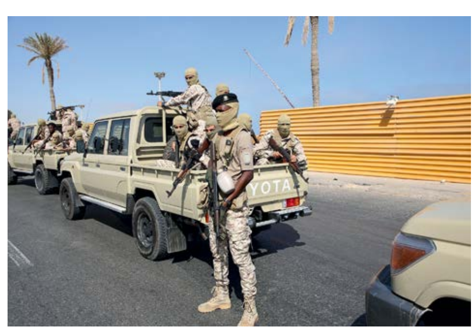
Various armed groups in Libya have foreign backing.