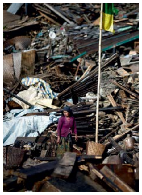
Survivor in devastated Barpak in 2015.

People in Nepali villages – and even in the cities – hardly have access to psychological support. The mental health of countless people has thus suffered long term.