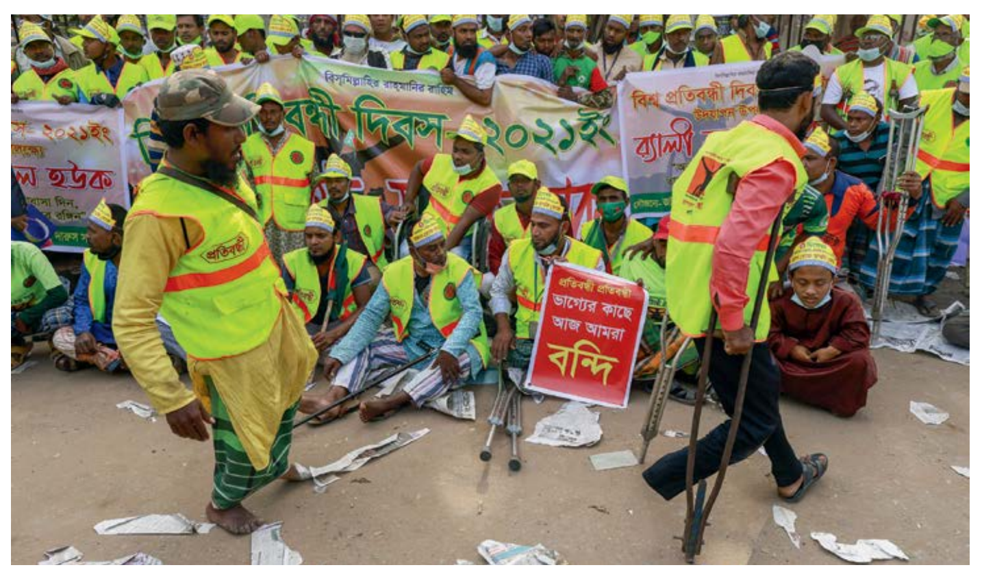
Attending a World Disability Day rally in Dhaka on 3 December 2021.