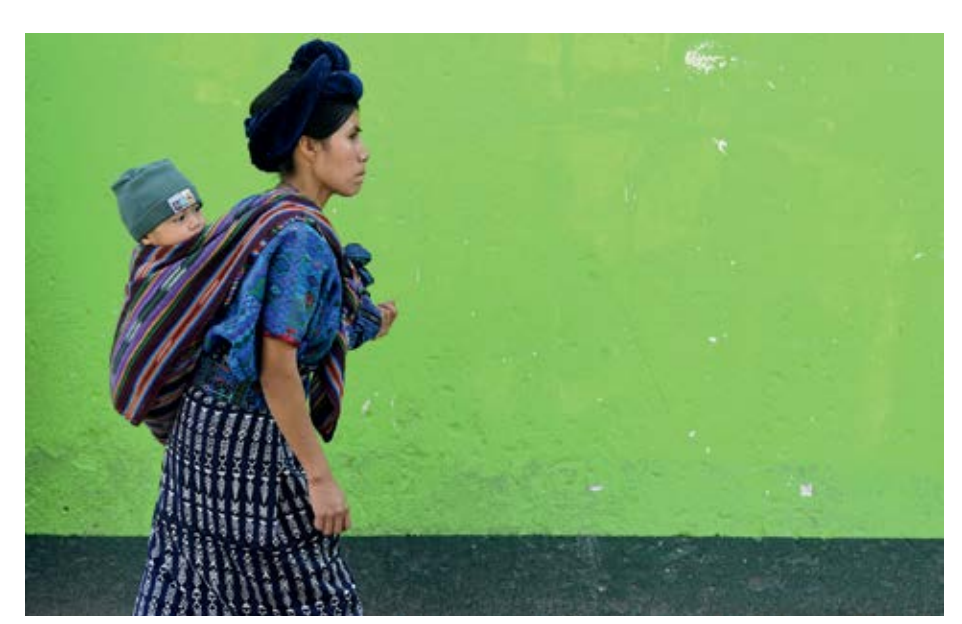
Indigenous people in Guatemala are disadvantaged: Maya woman with baby.

ed spaces. In very many cases, they will then manage to rebuild relationships, create social networks, live less stressfully with less fear and restart pursuing goals in life. In the course of this, they become aware of the resources that are at their disposal for processing their traumatic experiences. Otherwise, new traumatic experiences in the divided society around them will cause retraumatisation. We often work in groups. It is important to show them that there are others they can trust. It is also very important to talk about what goes on within a group, including conflicts and minor upsets. We call