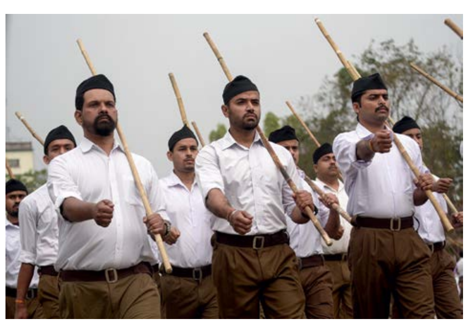
Hindu supremacists marching in Assam in early 2022.

The title of the new novel is "Zindeeq", which means "heretic". The main protagonist is from an educated and liberal Muslim family. After succeeding in school, he rises fast in the ranks of the military. From that point on, the plot turns to other issues. The young man's life is marked by unrest in Kashmir, growing nationalist and racist