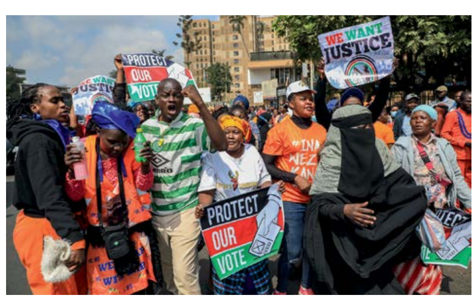
Protesting supporters of Raila Odinga in Nairobi after the presidential elections in August 2022.