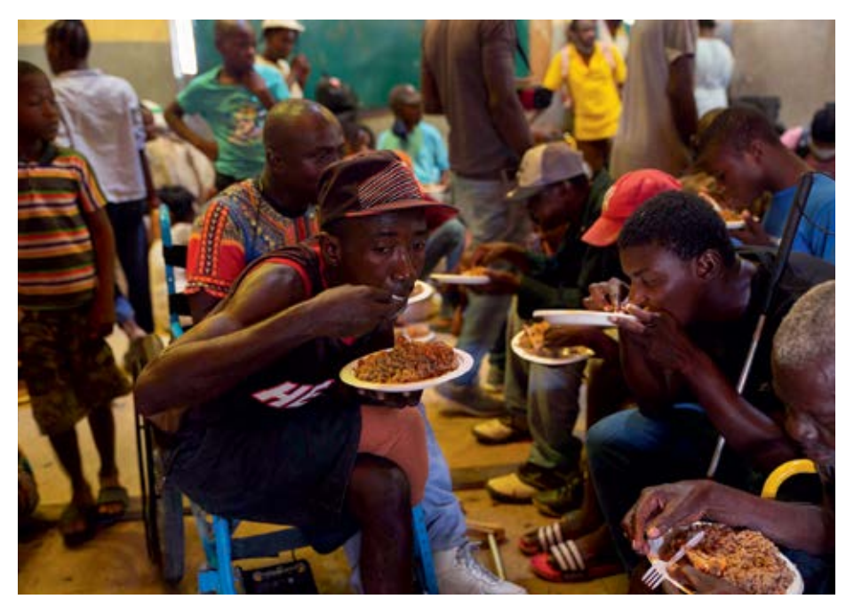
People with disabilities at a shelter in Haiti in 2021.