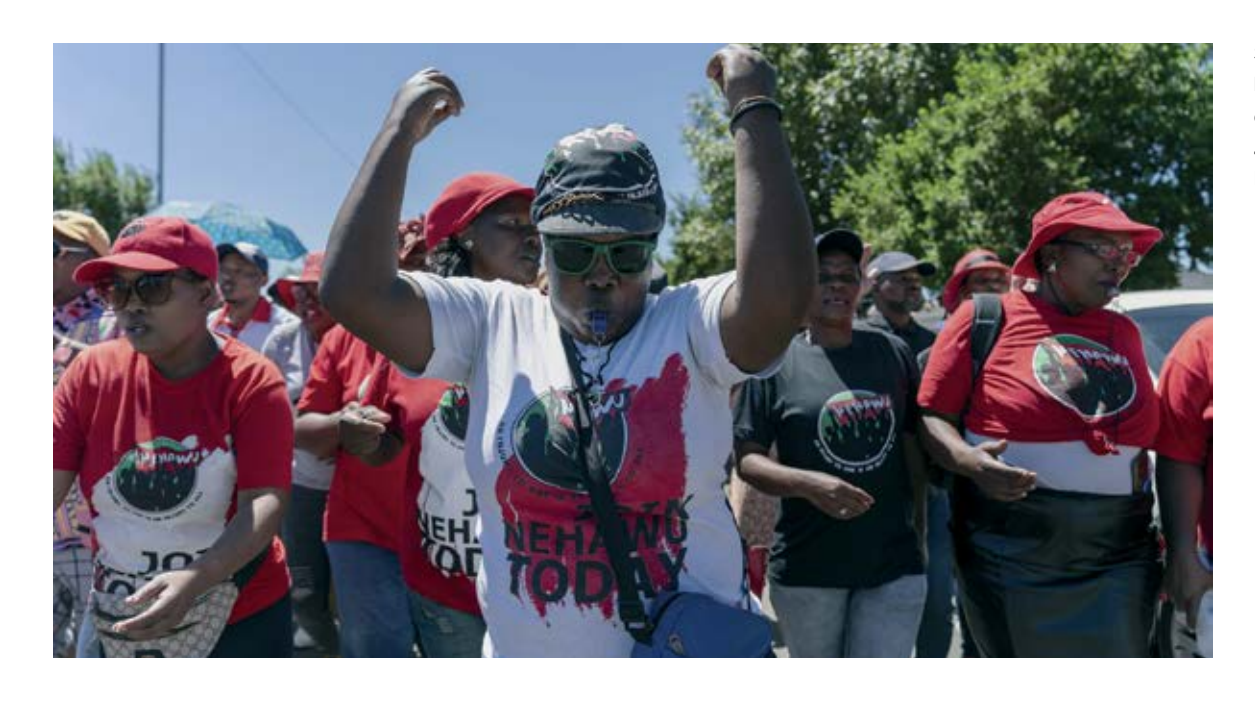
South African health-care workers demonstrating in Johannesburg in March for better pay.