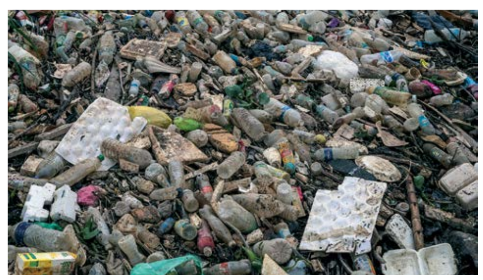
Plastic waste at a river in Kuala Lumpur, Malaysia.

Against this backdrop, a tightening of the EU's waste shipment regulation is currently being discussed. In December 2022, the EU Parliament declared its support for a general ban on the export of plastic waste