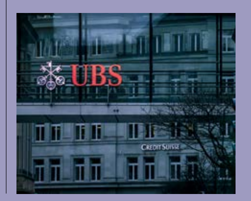
Swiss authorities made UBS take control of Credit Suisse – bank logos on different buildings in Zurich.

Nonetheless, both the Federal Reserve and the Swiss National Bank have raised interest rates in recent weeks. They thus stayed focused on fighting inflation. Having prevented a full-blown crisis of the financial system in March, both the Fed and the Swiss National Bank apparently feel they are in full control. JSS