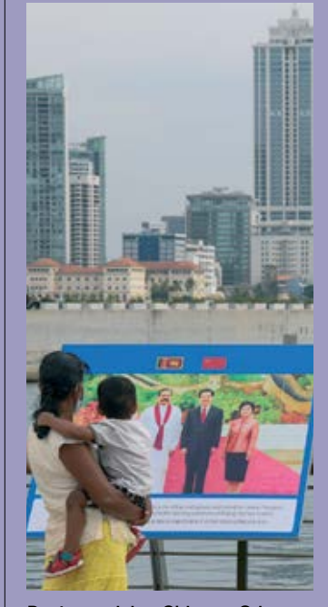
Poster praising Chinese-Sri Lankan relations in Colombo in 2022.

the same position in the past. They too were always hesitant to grant debt relief. Moreover, they showed very little interest in establishing a fully functional, pre-defined sovereign-bank-