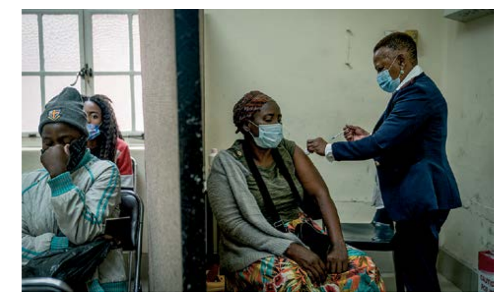
Covid-19 vaccination campaign in South Africa.