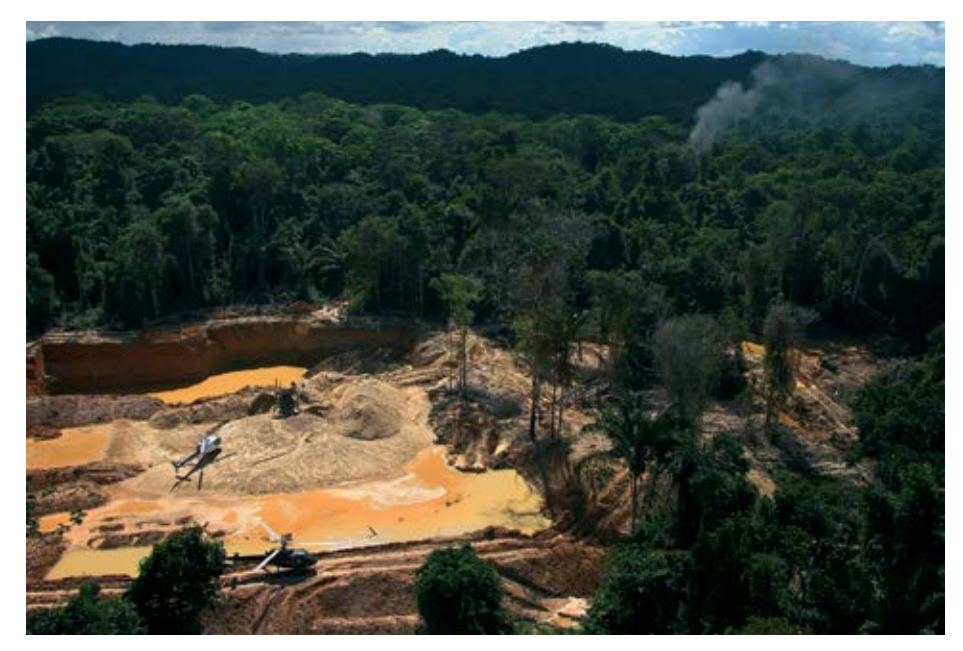
Illegal mining camp on Yanomami territory.

This humanitarian catastrophe did not come as a surprise. The Public Prosecutor's Office has been warning since last year that the government has not taken the necessary measures to evict the miners from Yanomami land. In 2020, the Supreme Court ordered a number of measures to protect indigenous communities, in particular an action plan to evict invaders from Yanomami land and six other indigenous territories. The Court also ordered the implementation of a plan to combat Covid-19 and promote food security, adopt health-care measures and establish sanitary barriers in indigenous areas. Indigenous representatives themselves claim to have made at least 21 calls for help to the government, the Public Prosecutor's Office, the National Foundation for Indigenous Peoples (Funai) and the Brazilian army since November 2020 regarding the dramatic situation of their communities. All were ignored.