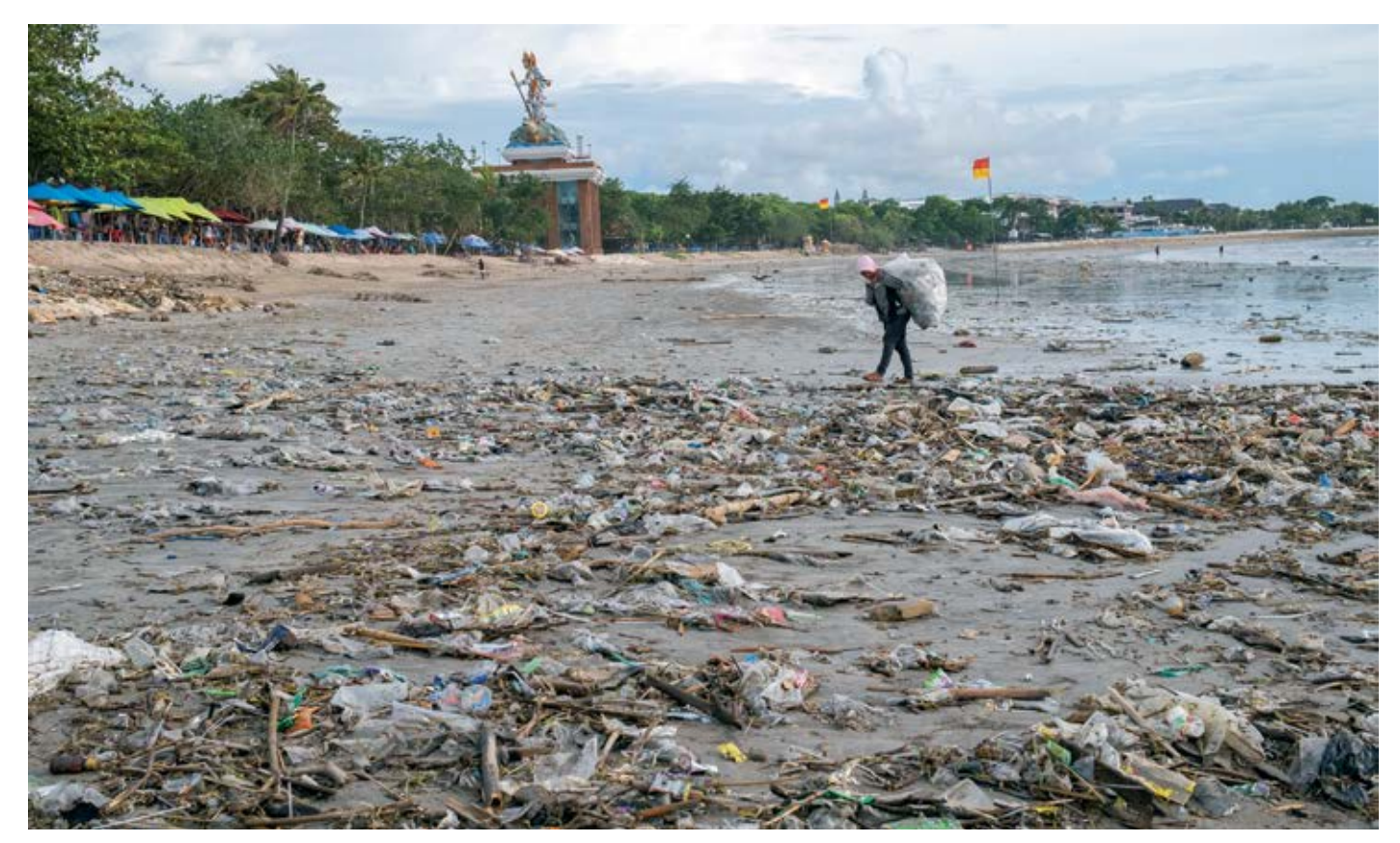
Vacation on a plastic beach: trash washed up on Bali.