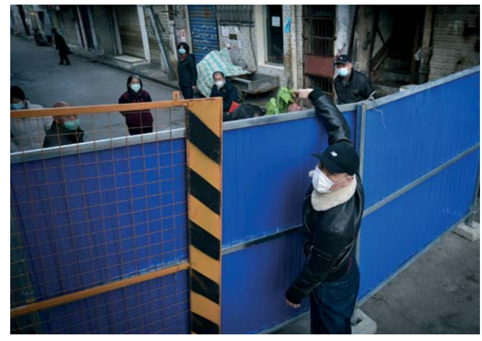
A residential area in Wuhan in early 2020. No country was prepared for the Covid-19 pandemic.