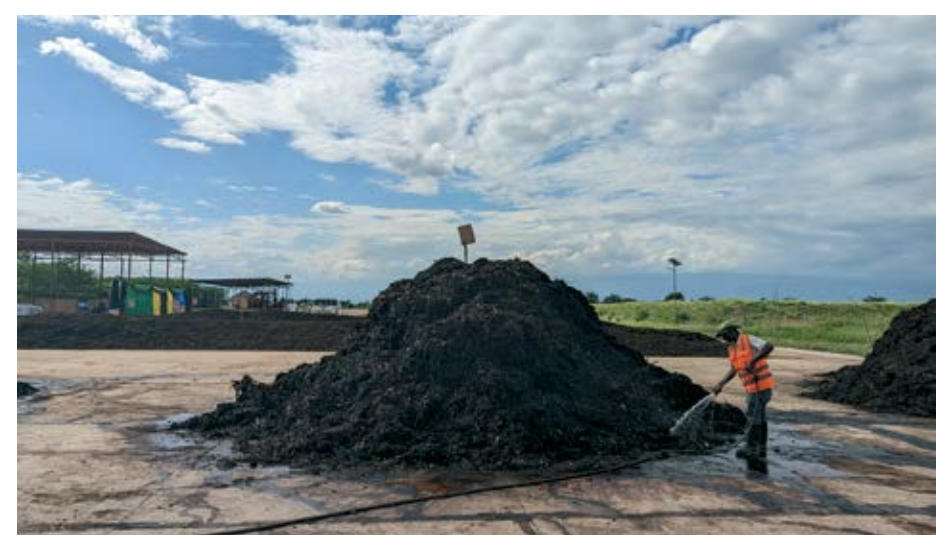
The plant's compost benefits local farmers.