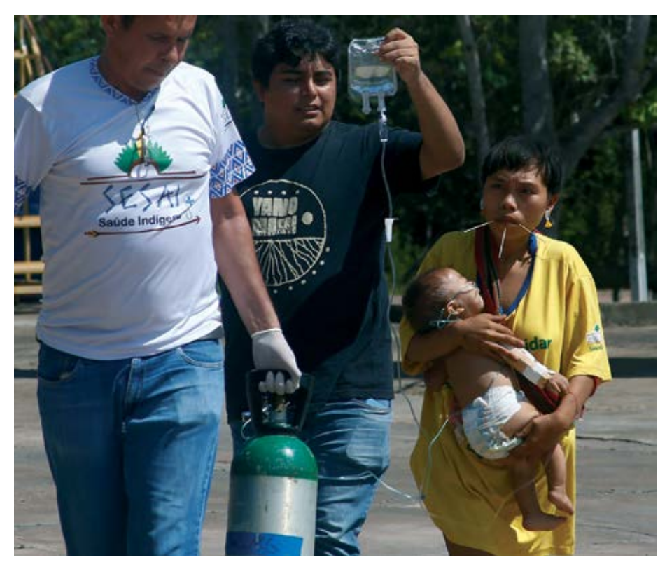
A sick Yanomami baby held by its mother was transported by plane from the Yanomami territory to receive medical treatment in Boa Vista, the capital of Roraima state, after the new Brazilian government declared a health emergency for the Yanomami people.

However, as of 2019, the situation has worsened considerably. According to a study published by the Hutukara Yanomami Association (HAY), illegal gold mining increased by 54% in 2022, destroying more than 2000 hectares of Yanomami land. The study also shows an exponential increase in deforestation due to mining since 2018, when the association began monitoring these activities. Their illegal mining monitoring system is based on imagery from