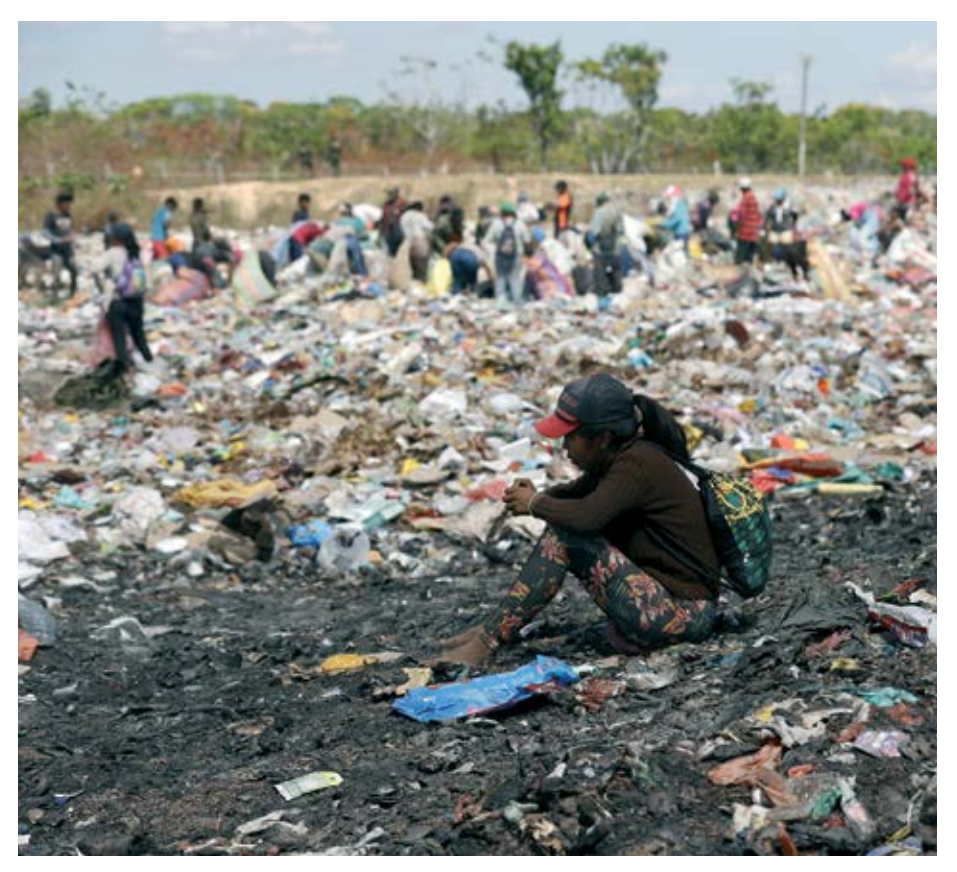
An informal waste picker in Puerto Carreño, Colombia. Many marginalised groups such as indigenous peoples earn their living like this.

The observation of circular-economy rules offers enormous potential for sustain-