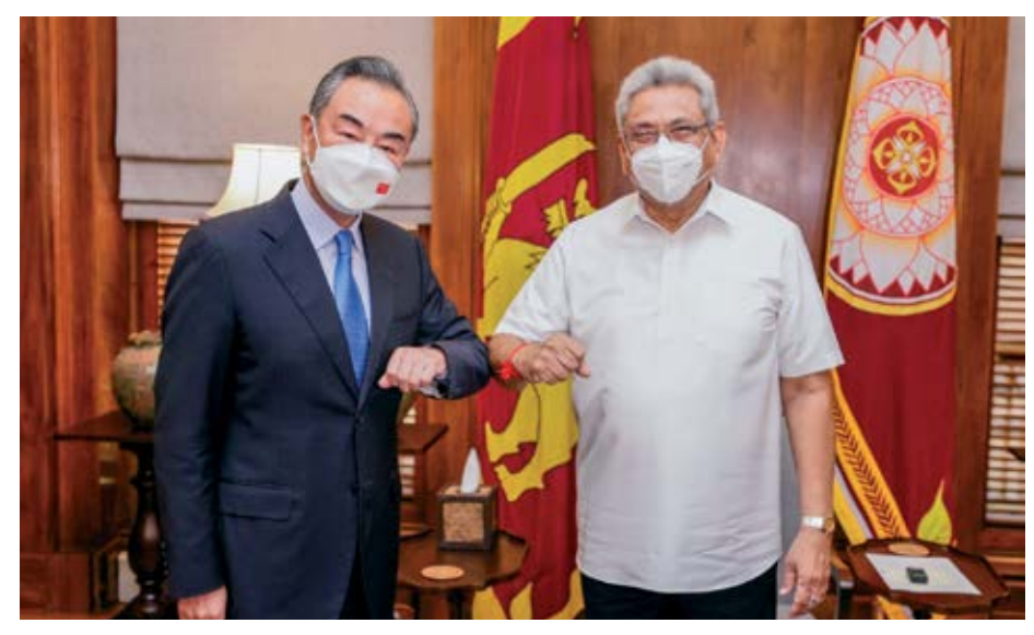
Gotabaya Rajapaksa, then Sri Lanka's president, with China's Foreign Minister Wang Yi in Colombo in early 2022.