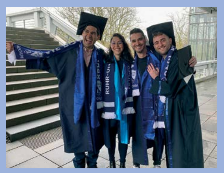
The author at the graduation ceremony in Bochum with fellow Latin American students in February 2022.

Despite the challenges, I know that my experience of migrating and returning to my home country have been quite privileged. I am grateful for that. But I keep thinking that many don't have the same luck I had. I wish more people all over the world were given the same opportunities. PC