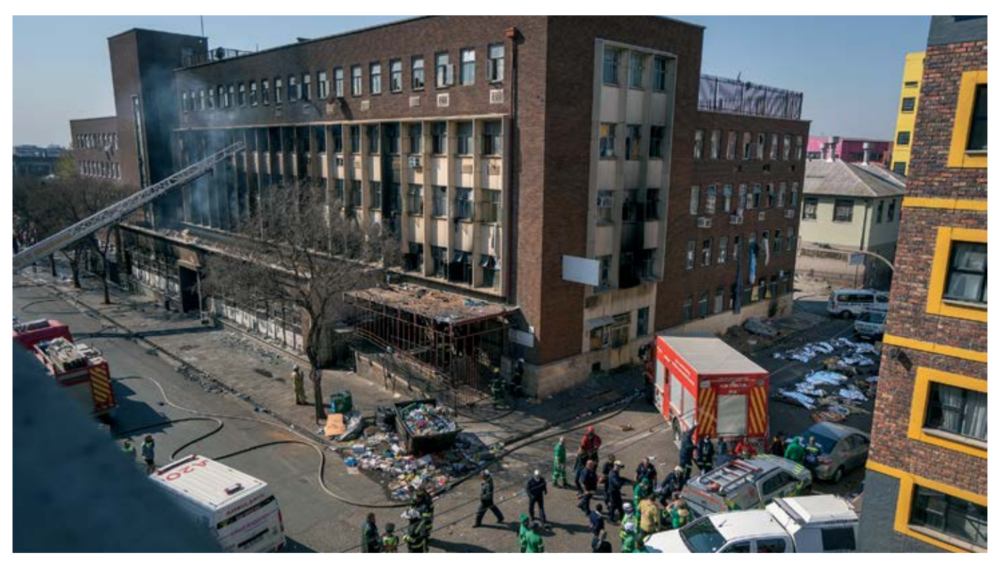
The building known as Usindiso Shelter after the deadly fire in August.