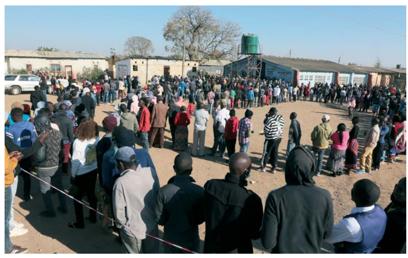
Queue outside a polling station for the 2021 presidential election in Zambia, which was followed by a peaceful transfer of power that strengthened democracy.