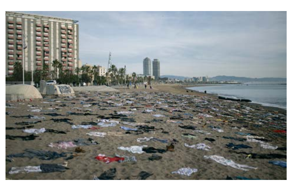
Act of remembrance in Barcelona, Spain, for around 2600 refugees who died in the Mediterranean in 2023.