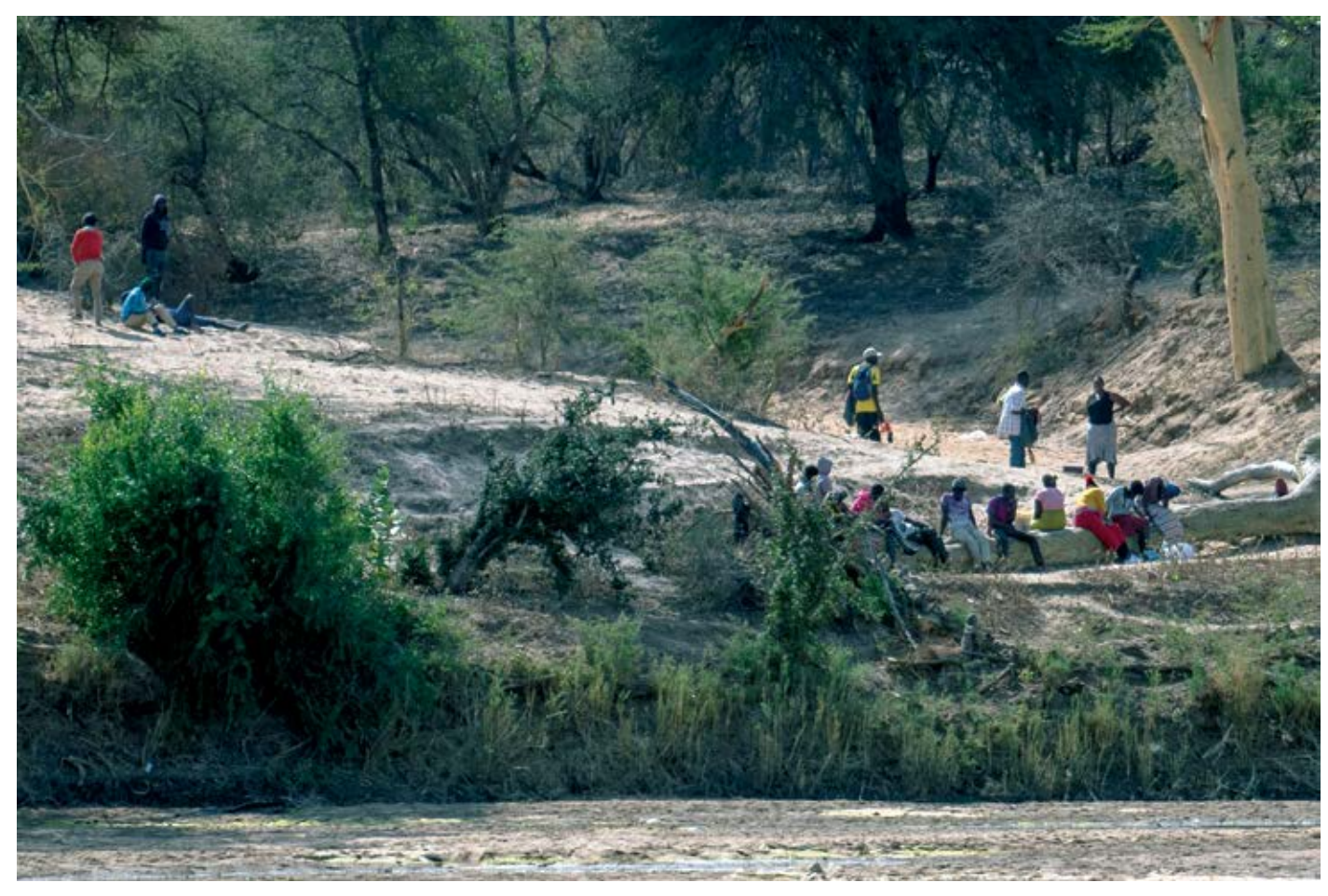
Zimbabweans wait to cross into South Africa on the dry bed of the Limpopo River.