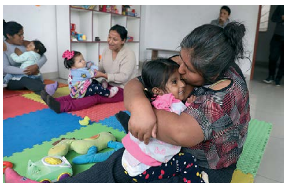
A mother and child workshop in Peru.

In Italy, almost all children start preschool at the age of three and attend until the age of five. Children in preschool participate in planned activities such as games, expressive or motor activities, in addition to lunch, a nap and an afternoon snack. Preacademic activities are introduced in the last year of preschool, but more emphasis is placed on respecting rules, such as raising