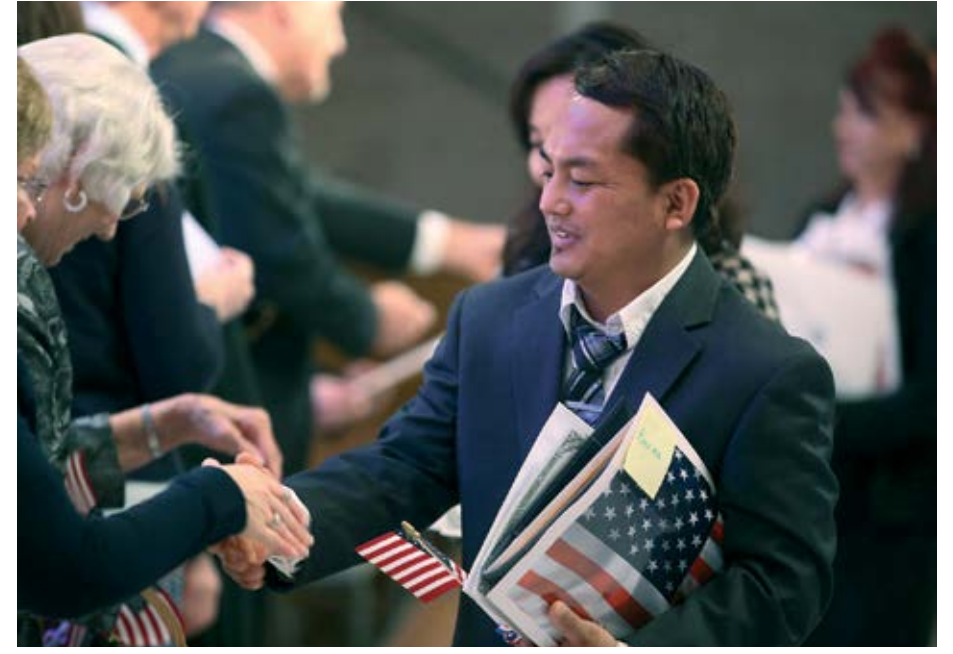
A man from Bangladesh takes part in a naturalisation ceremony in Oklahoma in 2018.