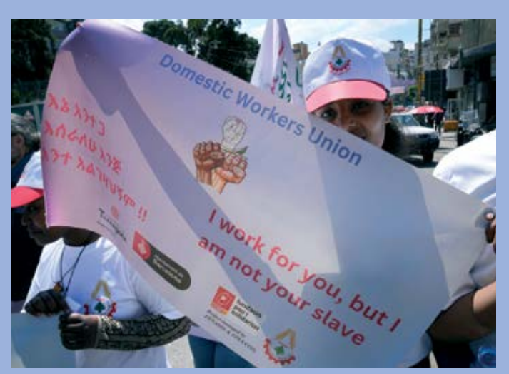
A migrant worker at an annual Workers' Day rally in Beirut, Lebanon.

Global Network of Sex Work Projects (NSWP), 2022: Briefing paper: Migration and sex work. https://www.nswp.org/resource/ nswp-briefing-papers/briefingpaper-migration-and-sex-work