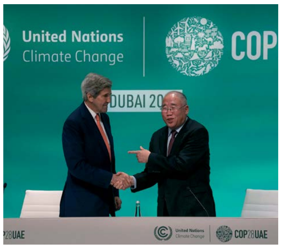
Cooperation on climate is indispensible: Special Envoys for Climate John Kerry (USA, left) and Xie Zhenhua (China) at the 2023 climate summit in Dubai.

Last but not least, democracy protection is also a question of attitude. A country like Germany can hardly promote democracy in other countries without examining the underlying values and viability of its own democracy. The pivot in democracy support must therefore also lead to better