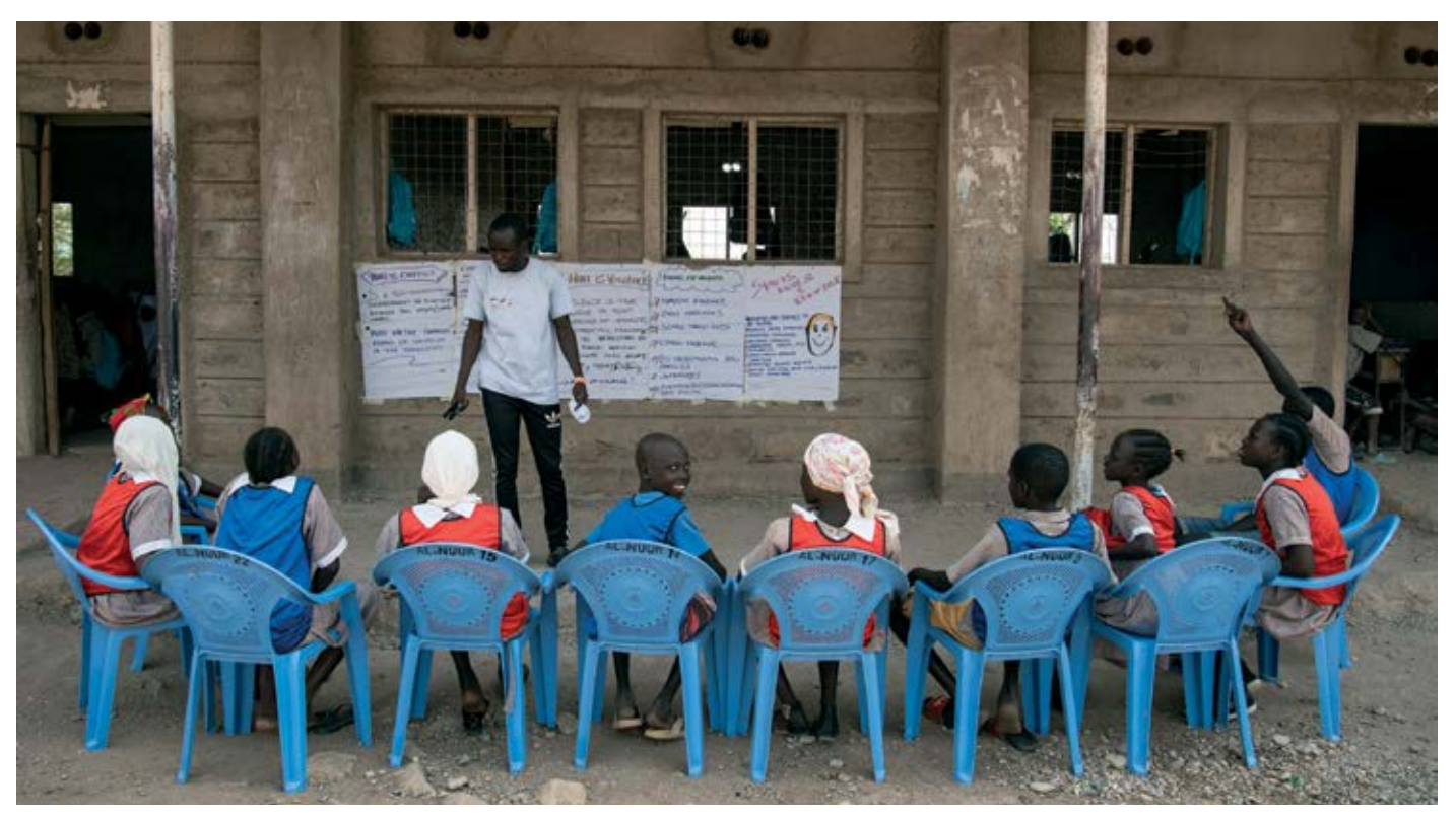
Children study in front of a classroom at Al Nuur Primary School in Kakuma.