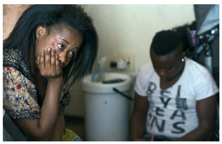
Woman who fled the Congo in Pretoria, South Africa.