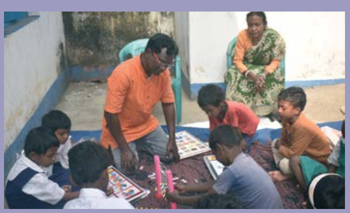
Maths lesson at a rural Santal pre-education centre.

In 2009, the national parliament passed the Right to Education Act (RTE). It is the most important law regarding education in India and focuses on universal schooling for the age group 6 to 14 years. Pre-primary school education,