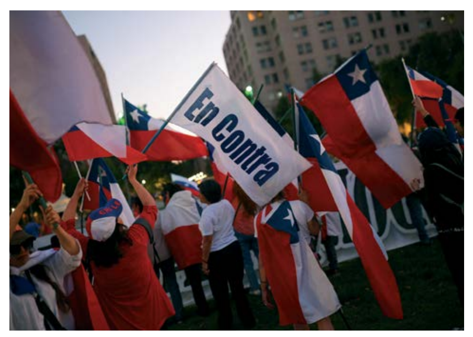
"Against": Protests on the day of the referendum on a new Chilean constitution in Santiago, Chile, in December 2023.