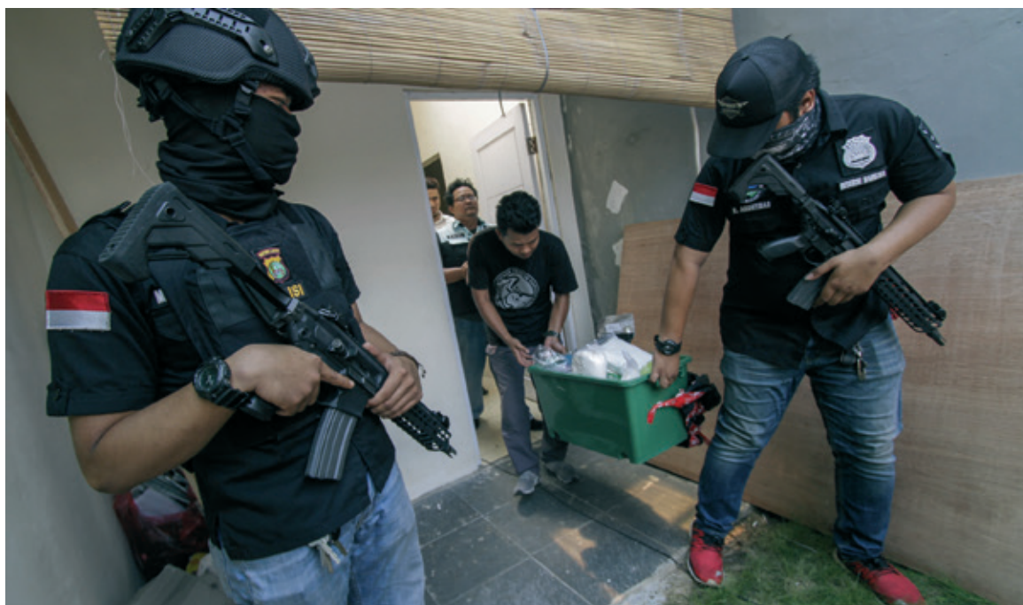
Police raiding an ecstasy lab in Bogor in 2018.