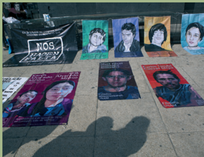
Commemorating victims of Mexico's war on drugs.

Human Rights Watch, 2018: Country report Mexico (in English and Spanish). https://www.hrw.org/world-report/2018/country-chapters/mexico