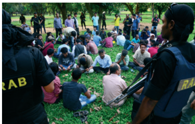
Soldiers of Bangladesh's Rapid Action Battalion (RAB) rounding up suspected drug dealers in Dhaka.

In spite of the prohibitive law, drug problems are escalating. A new drug called