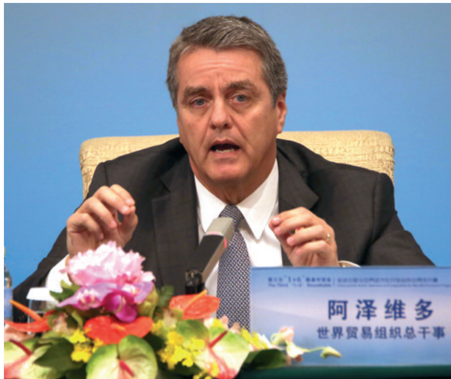
WTO Director-General Roberto Azevedo speaks at a press conference in Beijing in November.

Developing countries need to highlight the current gap between damage control and modernisation and take advantage of the existing impasse to advance own reform proposals. The deficiencies of the trade system are well known, but mounting conflicts have left member states with a new sense of urgency and willingness to address some of the flaws in the system. A good start could be to assess how the dispute settlement system can be made more accessible for developing countries, which so far have not been using it much. More generally, developing countries need to insist on a significant role in future plurilateral talks. They must ensure that their interests are equally represented and the negotiations advance – rather than diminish – the integrity of the multilateral system.