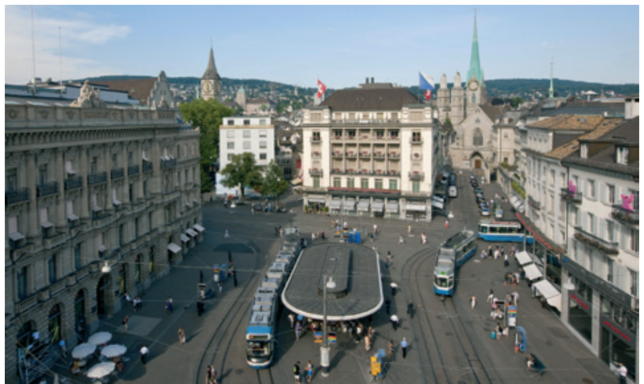
Paradeplatz is the centre of Zürich's financial district.