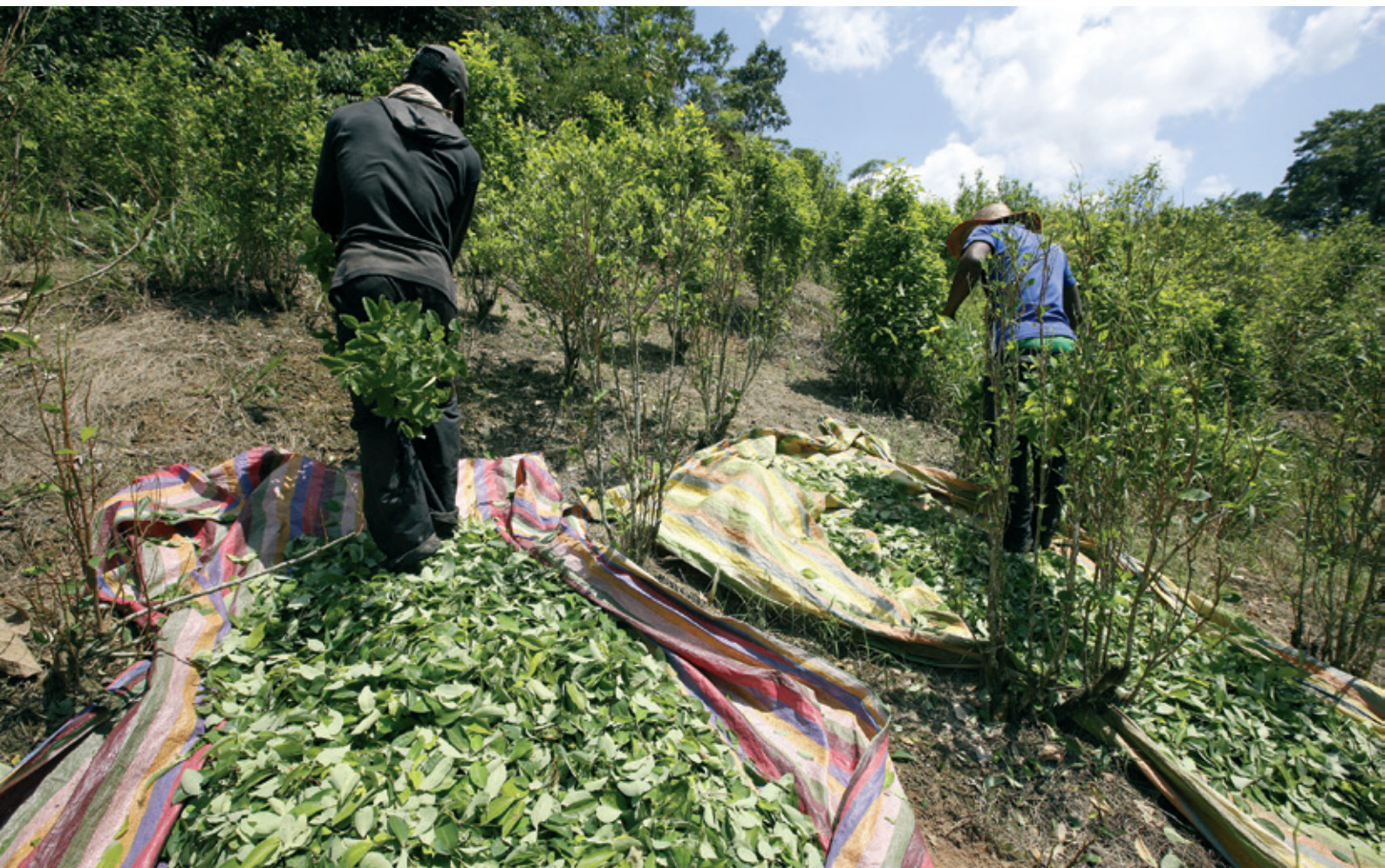
Coca harvest in Putumayo.