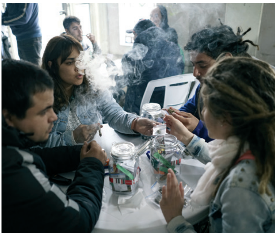
Marihuana smokers in Montevideo, Uruguay.

The IRCCA has published further information regarding the registered cannabis buyers: 49% are between 18 and 29 years old, 34% are between 30 and 44 years old, and 17% are older than 45 years. Seventy percent of the cannabis buyers are male, and 35% have a university degree. Of the people who grow cannabis for their personal use, roughly 70% live up-country and the rest in the capital Montevideo.