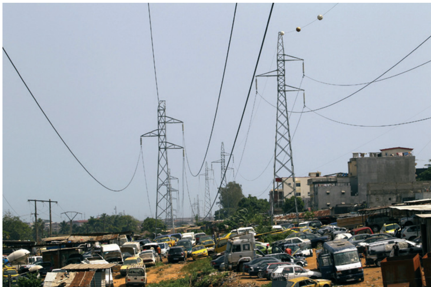
Transmission lines in Abidjan, Ivory Coast: the Economic Community of West African States and other regional communities are increasingly cooperating on electric-power supply.