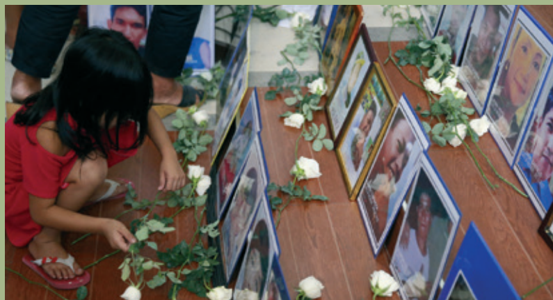
Commemorating victims of Duterte’s war on drugs in Manila on All Saints day, 30 October 2018.