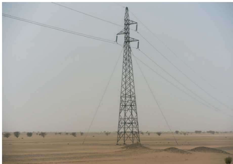
Infrastructure is vital for economic development: electricity pylon in the Sahara.