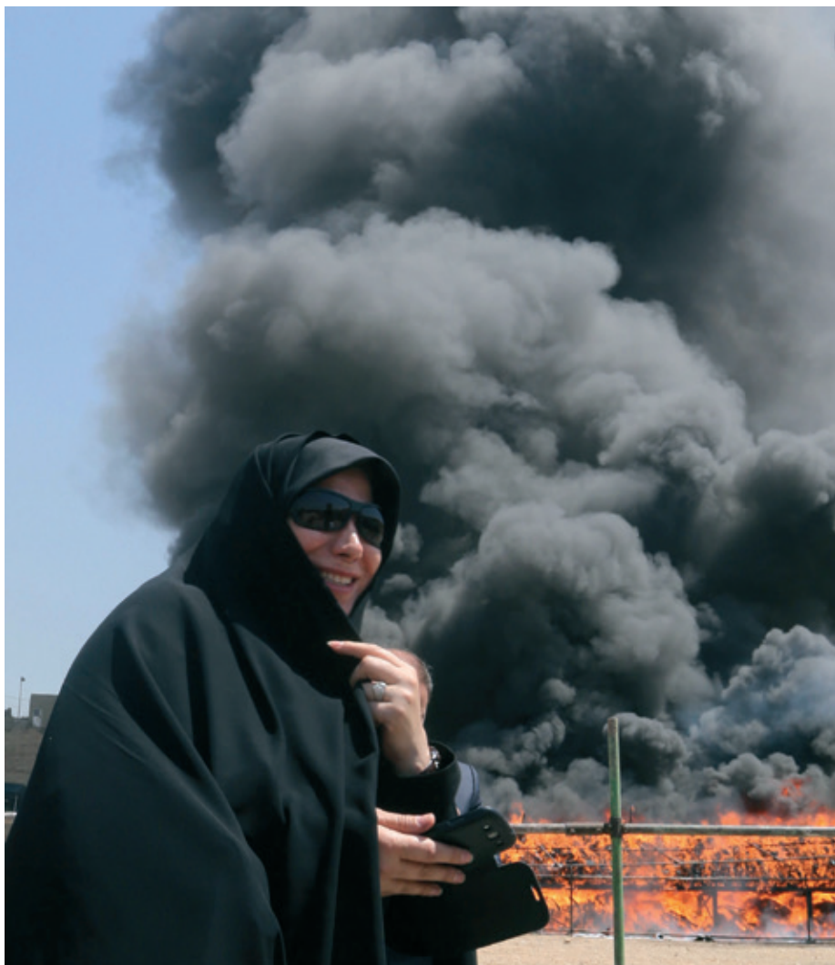
An Iranian woman watches confiscated drugs being burned in Tehran in 2013.