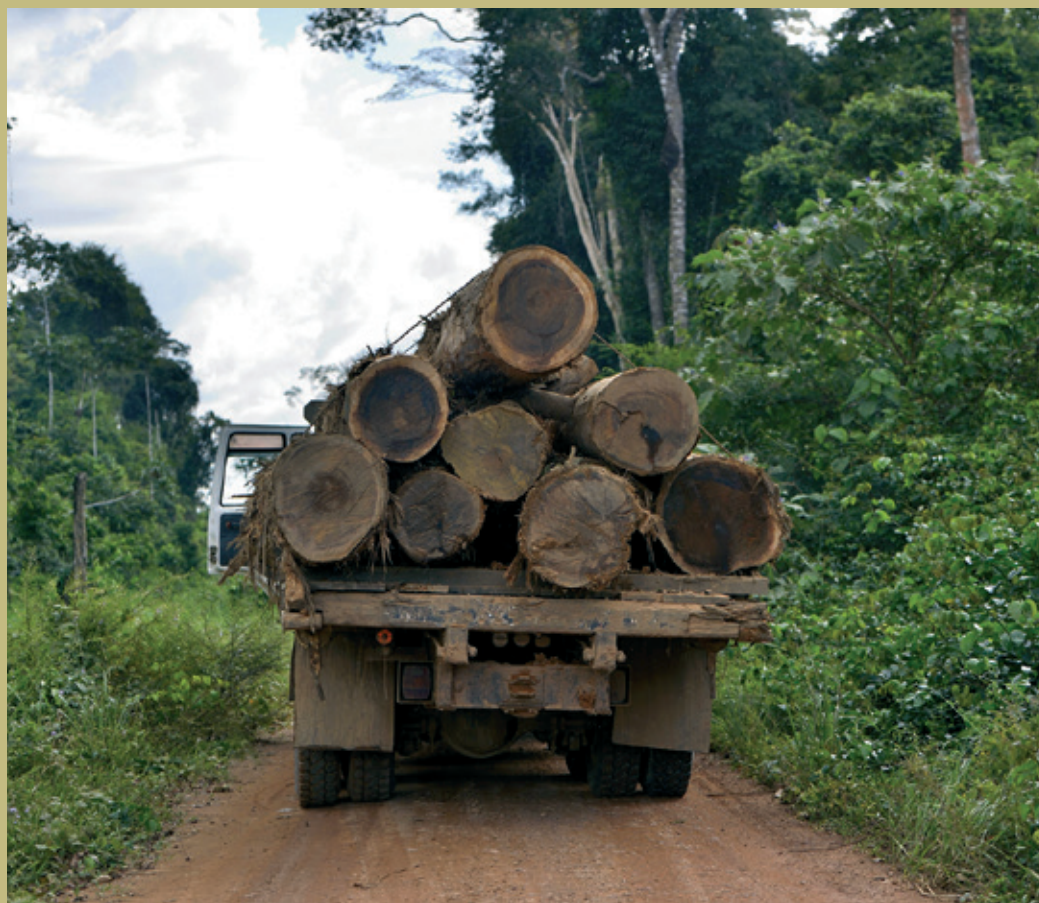
The destruction of the Brazilian rainforest is advancing.