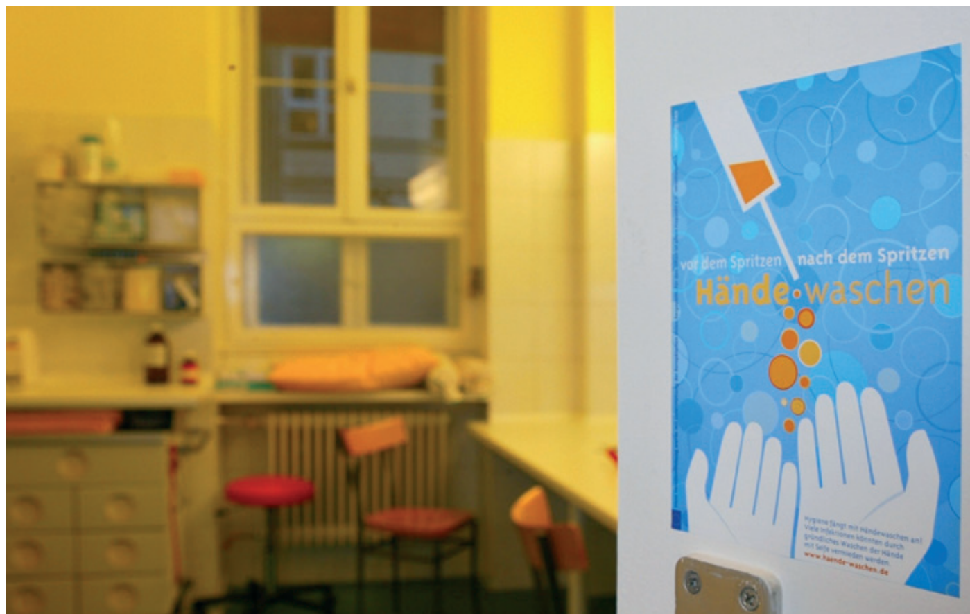
Harm reduction: poster in public facility for heroin addicts in Berlin admonishes users to “wash hands before and after injecting”.

Inglis elaborates convincingly why the term “free trade” does not inspire enthusiasm in China and India. In the 19 th century, masses of Chinese were opium addicts. The drug was shipped in via the Port of Guangzhou, which Europeans called Canton, in the Pearl River Delta. This was where China did its foreign trade. Corruption was rife. In 1939, the Chinese emperor banned opium imports – and that ban triggered the first opium war. The war went on for three years, and the British Navy proved far superior. In the end, China was forced to open four more harbours to international trade, and Hong Kong became a permanent British outpost in the Pearl River Delta.