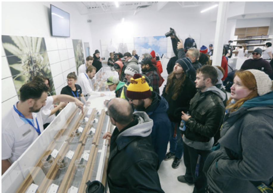
Shop counter in Winnipeg: cannabis is legal in Canada, but products may not be branded.

But doesn't it protect people from using drugs in the first place? Alcohol consump-