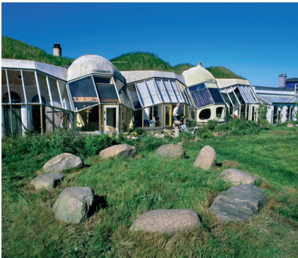
A model for the future? An ecological village in Denmark.

According to Boppel, climate change is linked to almost every other development issue, from fighting hunger to addressing the causes of migration. He stresses that the