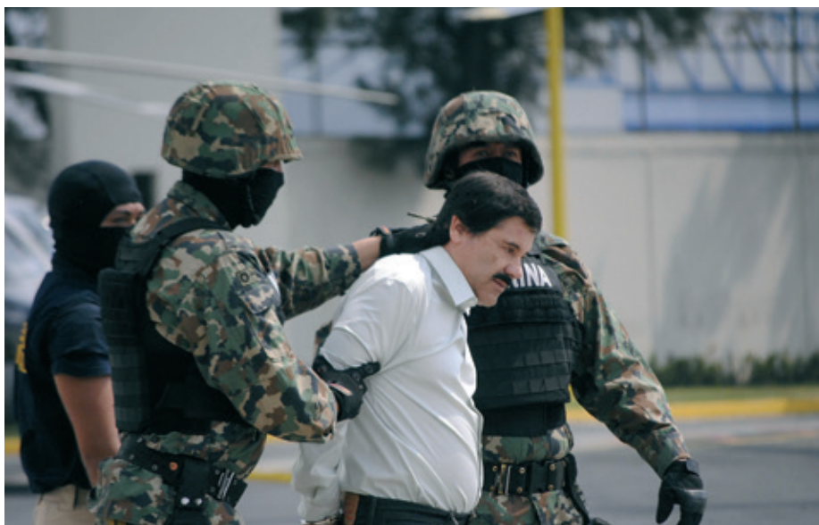
Joaquín "El Chapo" Guzmán being arrested for the second time in 2014. The head of the Sinaloa cartel managed to escape from prison twice, but was extradited to the USA in 2017.

Once more, peace was the main campaign issue. Frustrated, angry and hurt, the people chose AMLO to be the country's next top leader. He ran for the party Morena – the acronym stands for Movimiento de Regeneración Nacional (see my comment in D+C/E+Z e-Paper 2018/06, opinion section).