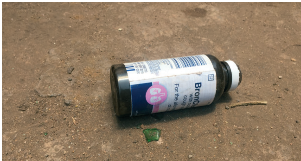
Empty BronClever bottle on a street in Harare.

tioner Hilton Hungwe explains, codeine is an opioid that serves as a painkiller. Due to its alcohol content, BronClever makes people feel extremely drunk “when they down a lot of it in one go,” Hungwe says, “which is why a lot of young people are turning to it.” The streets of Harare are strewn with cough syrup bottles.