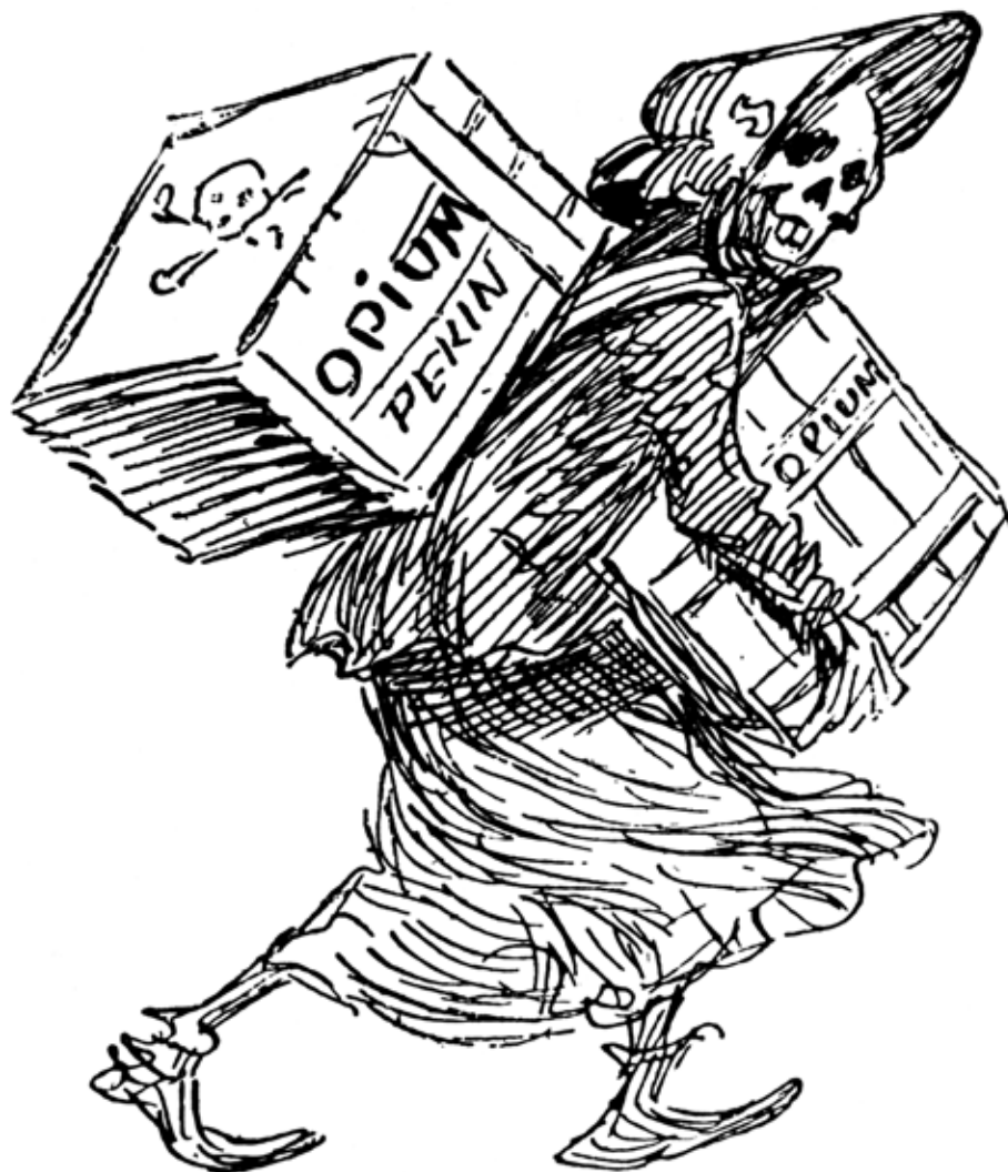
Cartoon published in the French periodical Le Rire in 1899.

An overarching message of the book is that opium is at once a blessing and a curse. Opioids are indispensably effective painkillers. On the other hand, addiction destroys people, families and communities, while organised crime thrives on black markets.