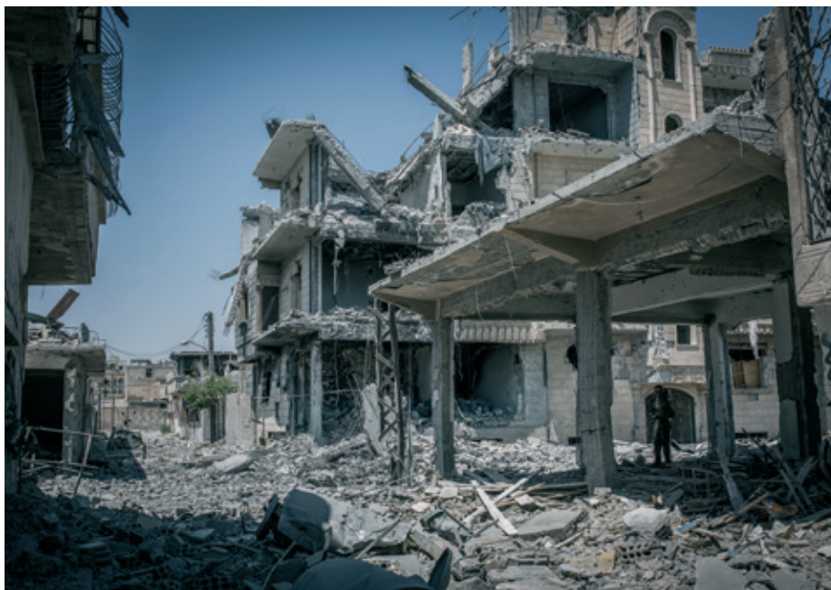
None of the country's main political players are in control anymore: member of the Syrian Democratic Forces in the ruins of Rakka in 2017.

The news for Syria stay alarming; the human-rights situation is depressing. The big question is whether peace will get a chance in some kind of reunited Syria. According to a recent report issued by Germany's Foreign Office, the police, security forces and secret service in Syria are systematically torturing members of the opposi-