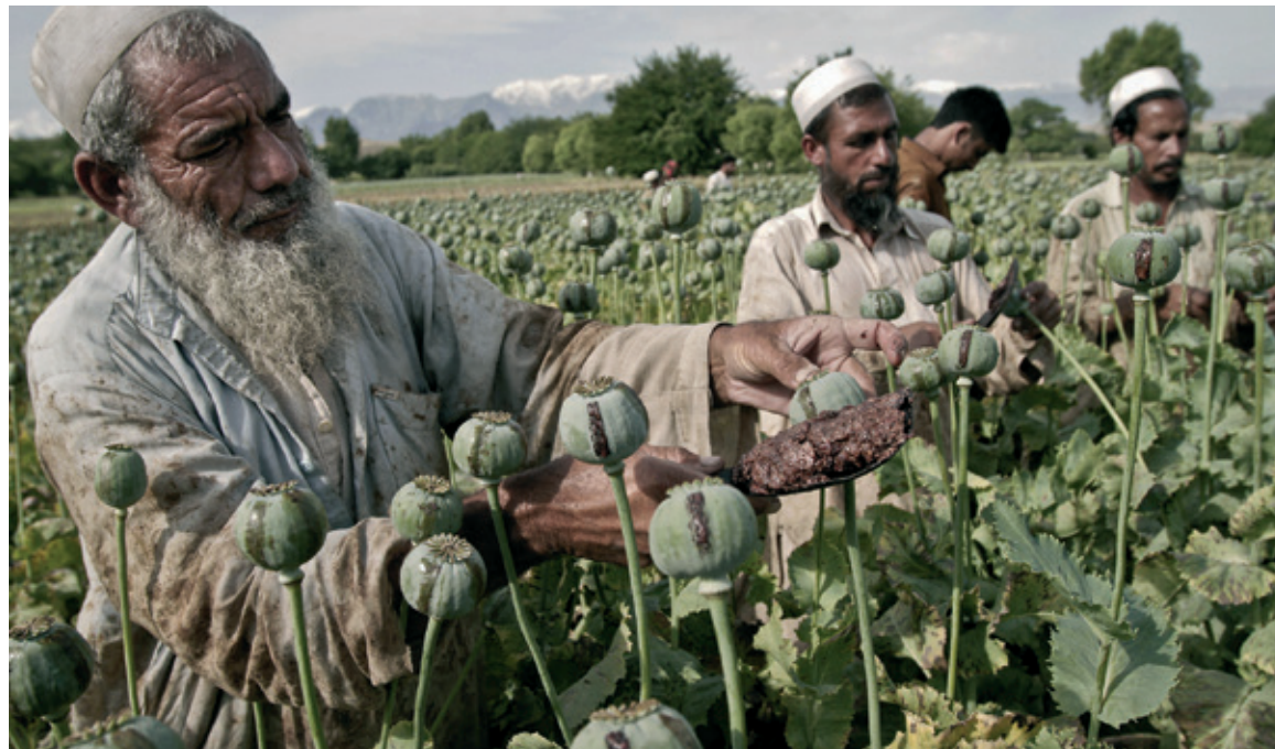
Afghan farmers harvesting opium.

Agriculture dominates Afghanistan's rural areas with weak infrastructure, and a considerable share of the people depends on poppy cultivation and drug production. In the western and northern regions, poppies are cultivated in about a third of all villages, in the west in over half, and in the south in almost 85%. Drug cultivation pro-