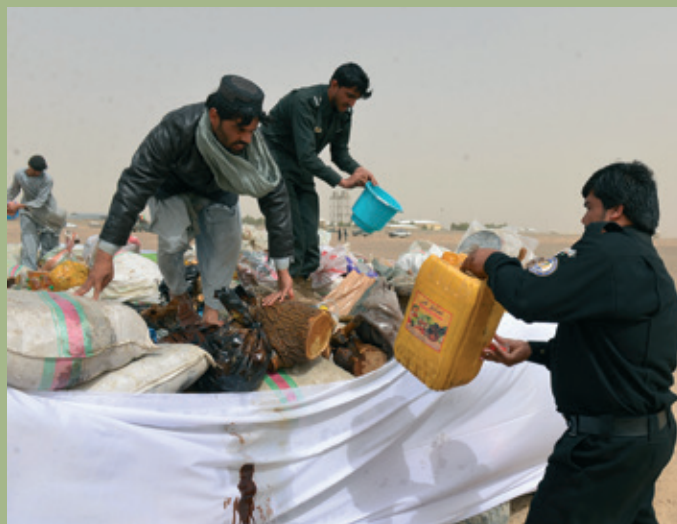
Afghan security forces prepare to burn confiscated drugs.

Since 2001, the drug industry has thus been inextricably linked to the state-building process. Key players understood how to use drugs to shore up their power. A holistic approach will be needed to uproot them. Development programmes must tackle underlying issues such as poverty first and foremost. To date, the focus has been on repressing the cultivation, processing and trade of drugs in the context of counterinsurgency measures. The approach was destined to fail. It will take decades to effectively repress a drug economy that grew resilient in 30 years of war. (jk)