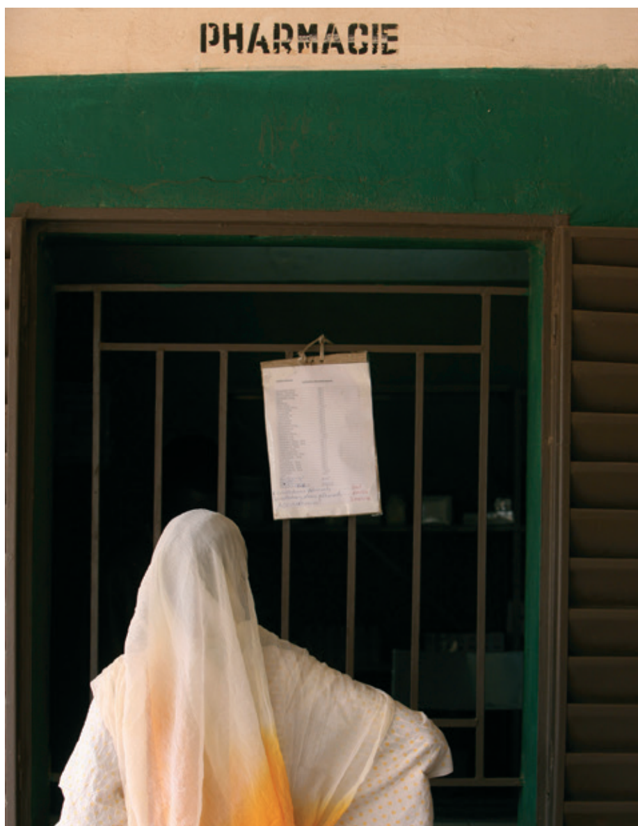
All too often, medication may be sub-standard: pharmacy customer in Mali.

According to the International Crime Police Organization (Interpol), Africa is the heart of the "biggest black market in the world". The Jacques Chirac Foundation estimates that the trafficking of pharmaceuticals is worth an annual $ 200 billion. One of the topics the Foundation, which was launched by the former French president, is involved in is promoting access to health care and quality drugs.