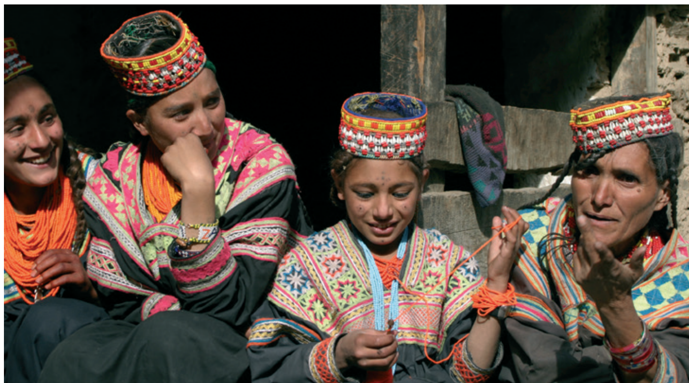
Kalash women and girls.