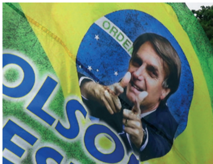
Bolsonaro's famous campaign gesture symbolising guns.

Bolsonaro will most likely take a similar approach. Aware of climate change being real, he will probably claim that forest protection is useless. As in the USA, Brazil's institutions may yet restrain the new leader to some extent by enforcing the laws. Given that Brazil's democracy is much younger, they will struggle even harder.