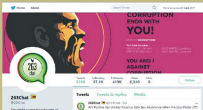
263Chat uses twitter to reach out to its audience.