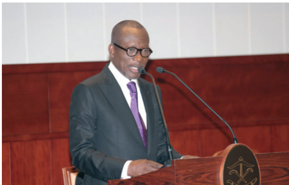
Increasingly controversial: President Patrice Talon speaking in Cotonou this year.

Not everyone appreciates this strategy, however. Benin is a low-income country that needs to roll back widespread poverty, and sanctions are likely to cause additional hardship. Those currently in power, of course, see things in yet a different light. They speak of “a desperate attempt to bring down the government” and “betrayal of the fatherland”. Such talk, needless to say, is merely empty populist rhetoric to opposition leaders.