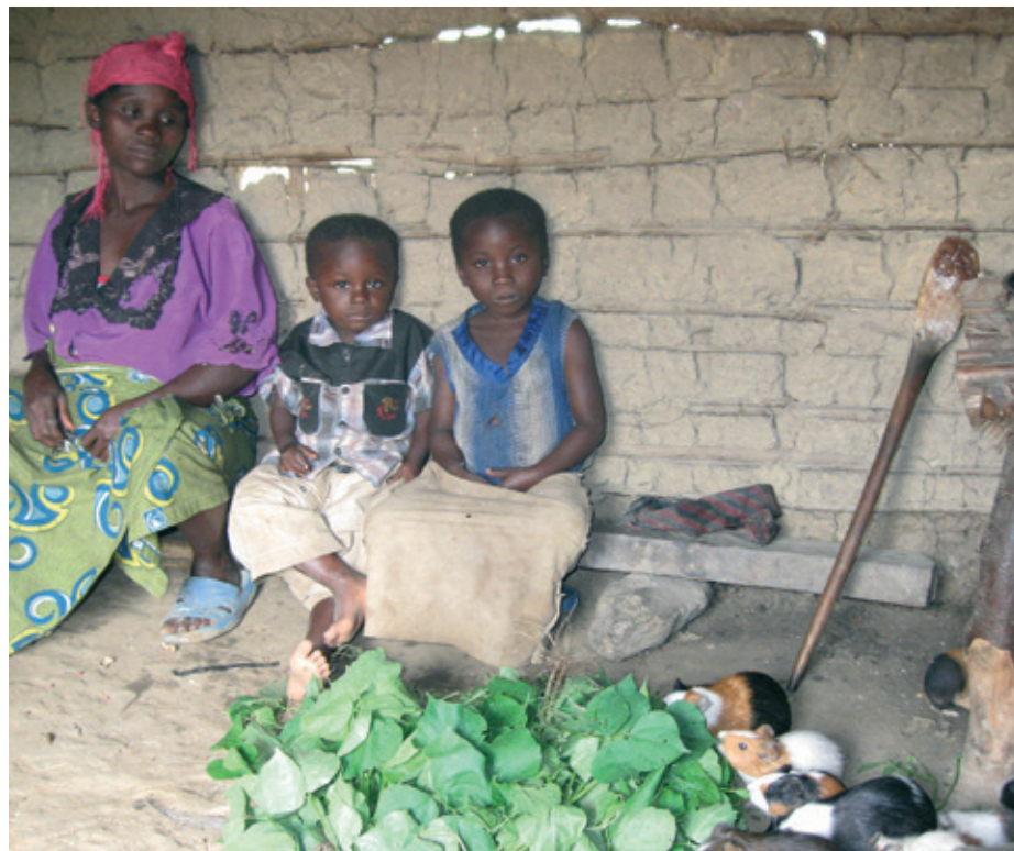
Cavies in the Democratic Republic of Congo.

hunted). Bushmeat is eaten throughout the continent. Cavy husbandry could thus help to protect biodiversity.