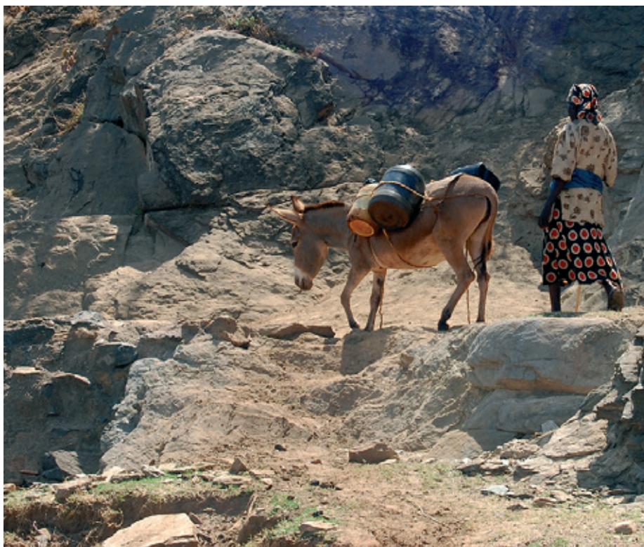
Food security is particularly at risk in East Africa's mountainous regions – women in Kenya's Machakos region are affected.

The authors also call for regular and systematic collection and publication of data on food security and soil degrada-