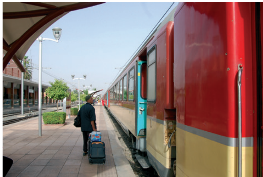
Station platform in Marrakech in Morocco.