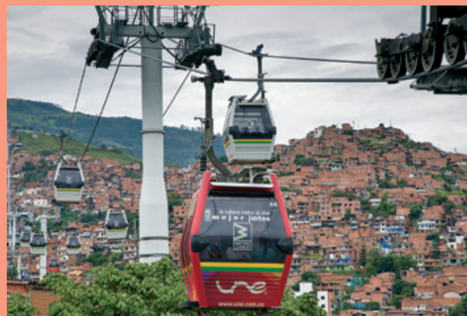
Aerial tramway in Medellin, Colombia.