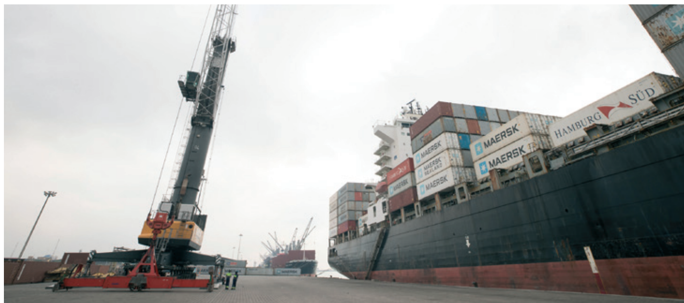
Container ship docked in Cotonou.