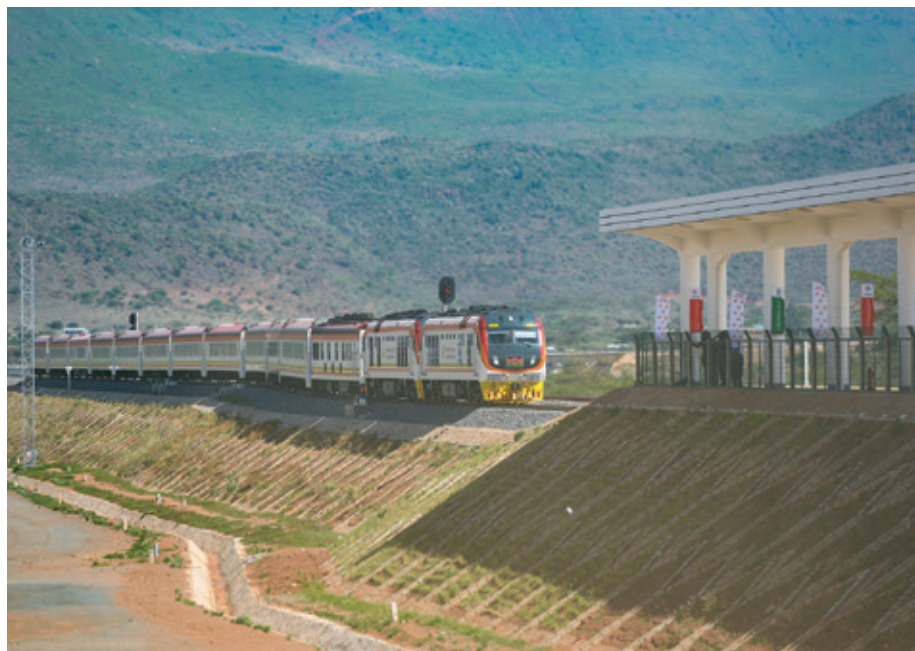
A train approaching Maai Mahiu station on the way to Naivasha.

Those cost totals are estimates, however. The full cost and the detailed breakdowns are not publicly known. When Ken-