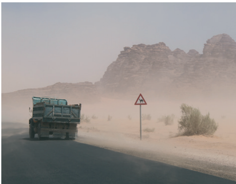
Road traffic presents many hazards; in Jordan, these include sandstorms and camels.

The authors of the Jordanian study point out that enacting laws is not enough – they must also be enforced. In developing countries, however, there are often not enough police officers, or they are not well educated or well equipped. Furthermore, there is often no national strategy to improve road safety, and if there is, it is not well implemented. The authors believe that it is urgently necessary that all countries