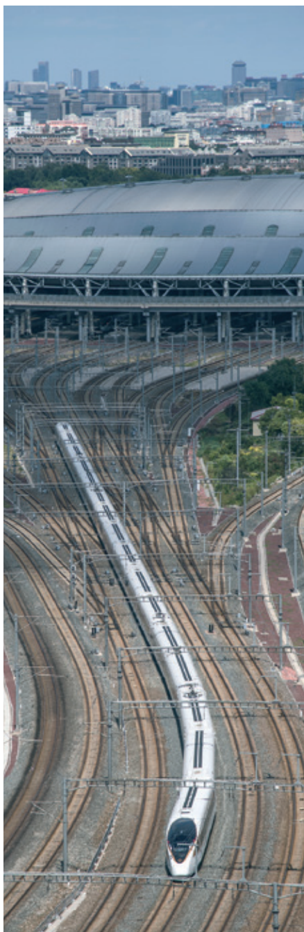
High-speed train leaving Beijing South railway station.

Nonetheless, it is evident that policy measures are making a difference. Ahead of the Beijing Olympics in 2008, the authori-