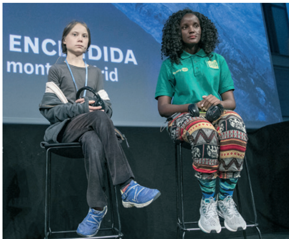
Greta Thunberg and Vanessa Nakate during a side-event at the climate summit in Madrid.

The challenges are huge, not least because the UNFCCC process is in total disarray. The EU must go ahead without guarantees that other prosperous world regions will follow. The situation may be a bit better at the following summit next year which will take place shortly after the US elections. If