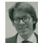
HUGH WILLIAMSON is the director for Europe & Central Asia of Human Rights Watch, the international non-governmental

The appointment of a new European Commission and the election of a new European Parliament offer opportunities for more focused and assertive steps by the EU in Central Asia. To protect the rights of the region's population it is vital for the EU to fulfil its important role on human rights in the region as effectively as possible.