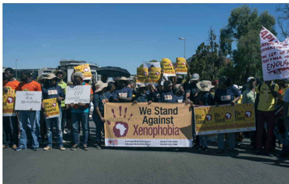
Protest march against xenophobia in Johannesburg, South Africa in March 2017.