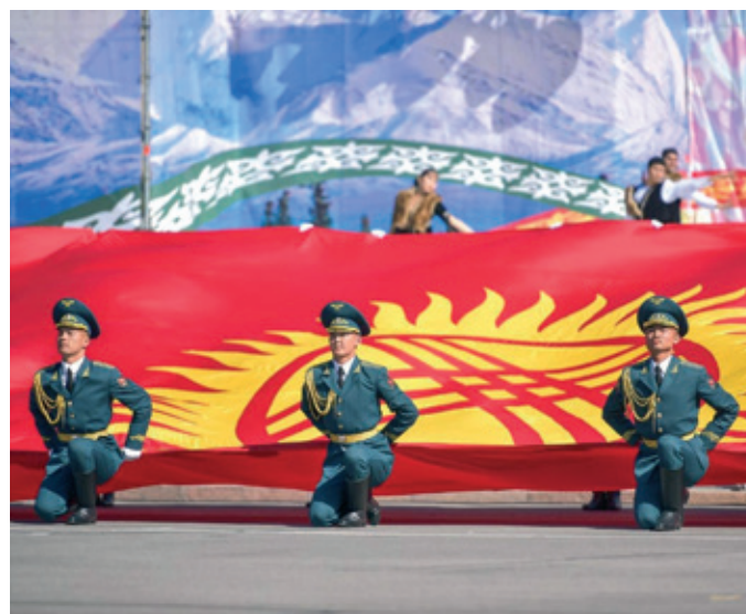
Kyrgyzstan is Central Asia's only parliamentary democracy: soldiers taking part in independence-day celebrations in Bishkek, the capital, in 2018.

In Turkmenistan, one of the world's most closed countries, the government is responsible for the enforced disappearances for nearly two decades of dozens of former officials and perceived critics. Relatives suffer the agony of not knowing if their loved ones are dead or alive.