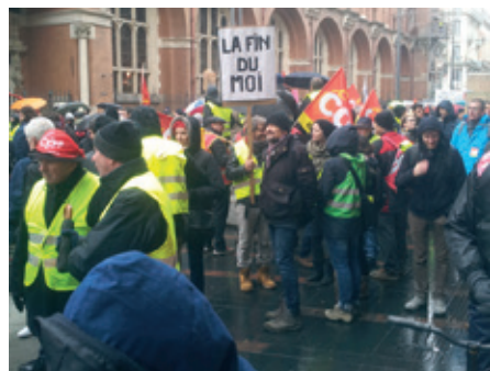
Gillets Jaunes protest in Toulouse in early 2019.

ies (SOAS) in London put it rather forcefully: “Globally social protection systems are in a mess ... the state has been cutting back on universalistic income support; social insurance is giving way to social assistance, with an array of poverty traps and unemployment traps; and enterprises of employment are cutting back on social benefits and services, at least for their workers” (Standing, 2007, p.28). Such developments were particularly noteworthy in Europe, the continent that pioneered social protection.