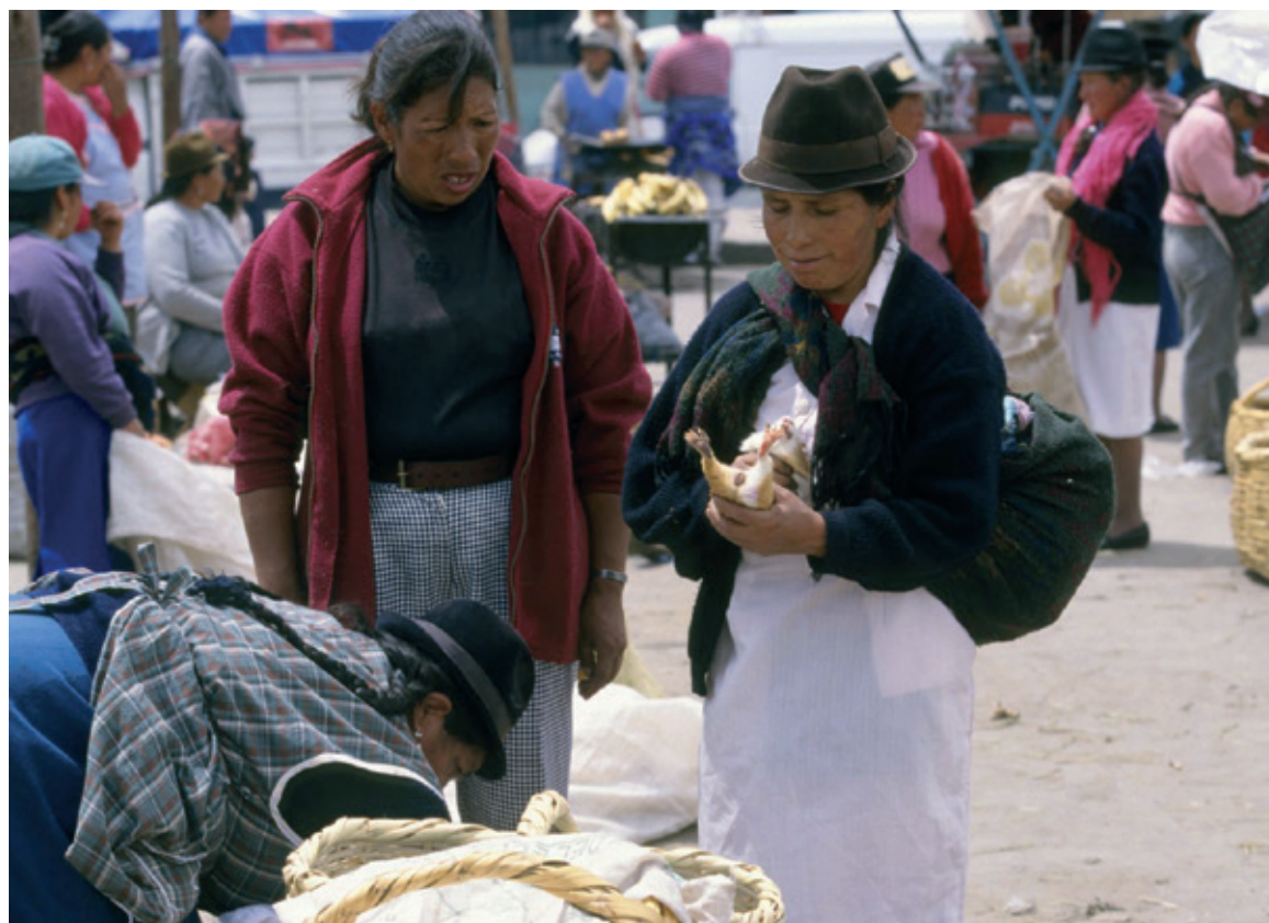
Cavies are sold for food at a market in Ecuador.