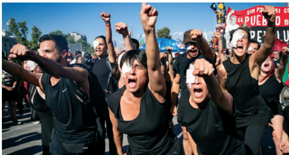
Bandaged eyes have become a symbol of human-rights activism in Chile.

In the meantime, Piñera has promised Chile will get a new constitution. If things go well – a big if – his nation will be able to vote for fundamental change in 2020. In Bolivia, Áñez has promised elections. However, it is not clear who will lead Morales' left-of-centre party and even less clear that the elections will be fair and free.