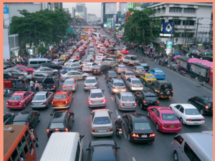
Traffic chaos in Thailand's capital.

Bangkok is a good example for roads often being governed not by fairness, but by the idea that might makes right. Cars, vans and buses force two-wheeled vehicles onto the shoulder and motor-