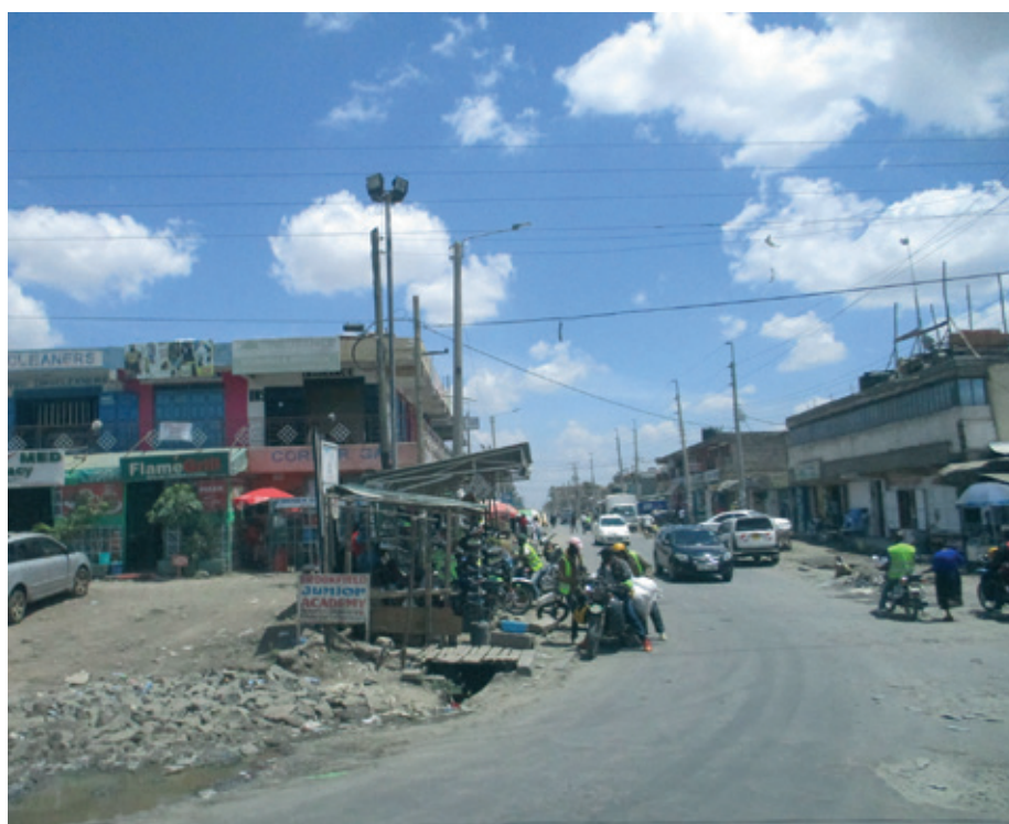
Infrastructure in the Nairobi agglomeration mostly facilitates motorised traffic.

Transport planners in Nairobi are promoting non-motorised transport to improve