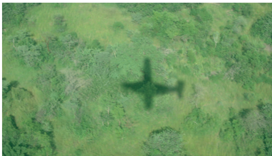
Shadow of small airplane flying over South Sudan.

Commercial flights are infrequent and expensive. A flight from Pibor to Juba costs up to $270, which is more money than most South Sudanese people earn in a year.