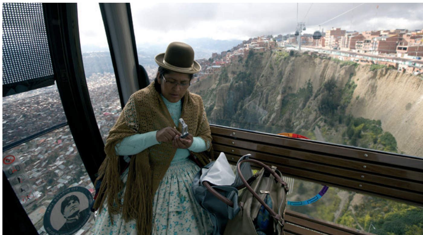
An indigenous woman rides the aerial tramway that connects the Bolivian capital La Paz with neighbouring city El Alto, 400 metres higher.