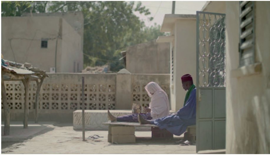
A small town is used to showcase how Islam is lived peacefully in northeastern Senegal.

New York to study film. Every time I said I am a Muslim, people had a certain idea of what that is, and I had to explain, ‘no, Senegal is different, that is not how we live Islam.’” Senegal is officially a secular state and