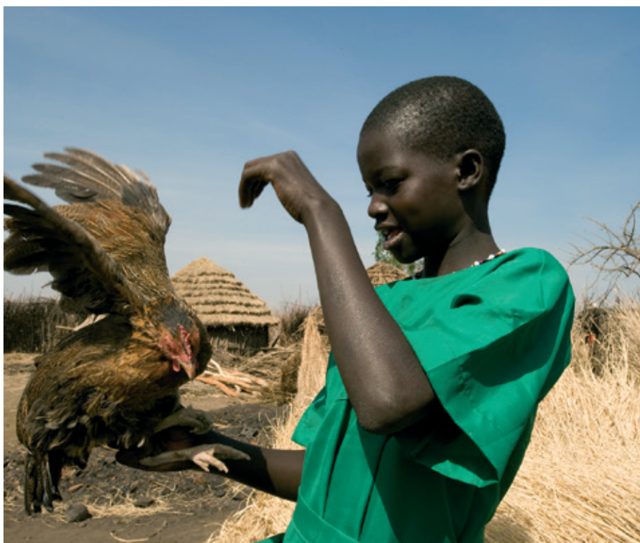
Chickens are protagonist Chinonso’s best friends.