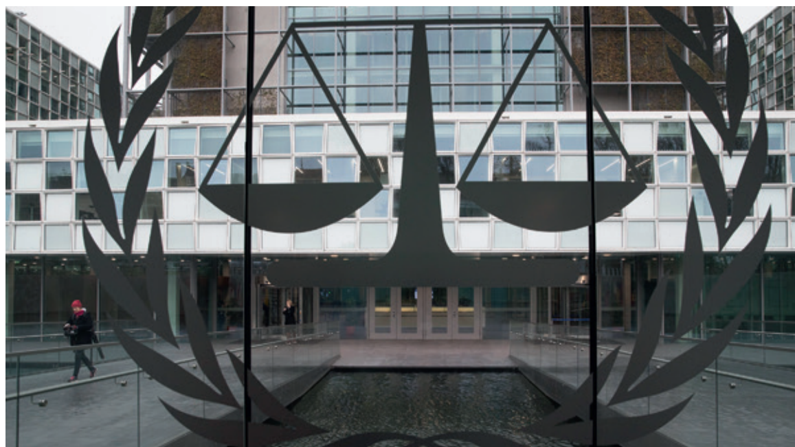
The International Criminal Court in The Hague.