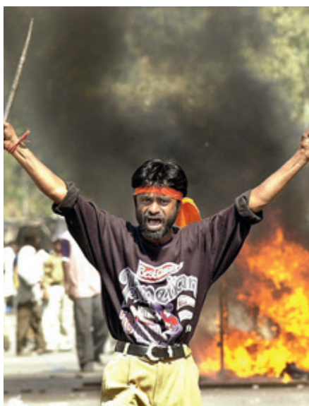
Rioter in Gujarat in 2002.

So it is more about taking revenge than solving problems. It is striking that, even though Modi promised to be an economic reformer, he has hardly achieved anything on that front.