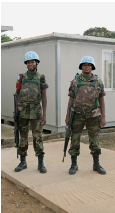
UN peacekeepers in Côte d'Ivoire in 2012.

According to the World Bank-UN publication, the number of intra-state conflicts has steadily increased since 2010. Various kinds of non-state organisations are said