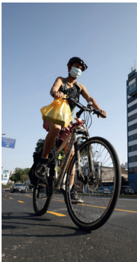
Cyclist using newly established bike lane in Covid-19-hit Lima, Peru's capital city.

As the example of the USA in the 1930s showed, government spending can lead an economy out of a depression, even if that spending is based on significant public debt. Investments in infrastructure are particularly useful because they not only create short-term employment, but also lay the foundation for long-term prosperity.