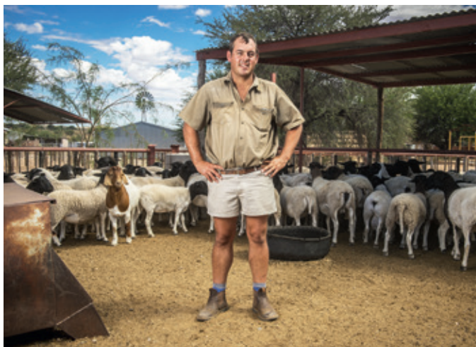
White farmers still own most of the commercial farming land.

In mid-2015, a spokesperson of Germany's Foreign Office acknowledged, after