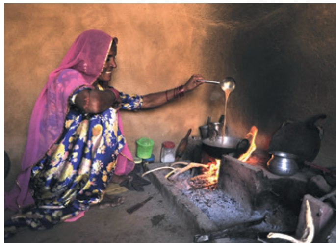
Fumes make cooking a health hazard for rural women – not only in the Indian state of Rajasthan.

Considering the many unknowns surrounding the Covid-19 pandemic, it is worth noting that at least one factor is indisputable: having a respiratory disease increases one's vulnerability to the virus.