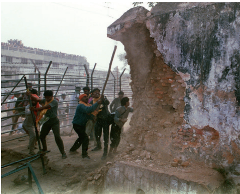
Hindu fanatics tearing down Babri Mosque in 1992.

Yes, that was terrible. However, state institutions generally still endorsed secularism, and we hoped things would eventually improve. Muslims and Hindus often viewed