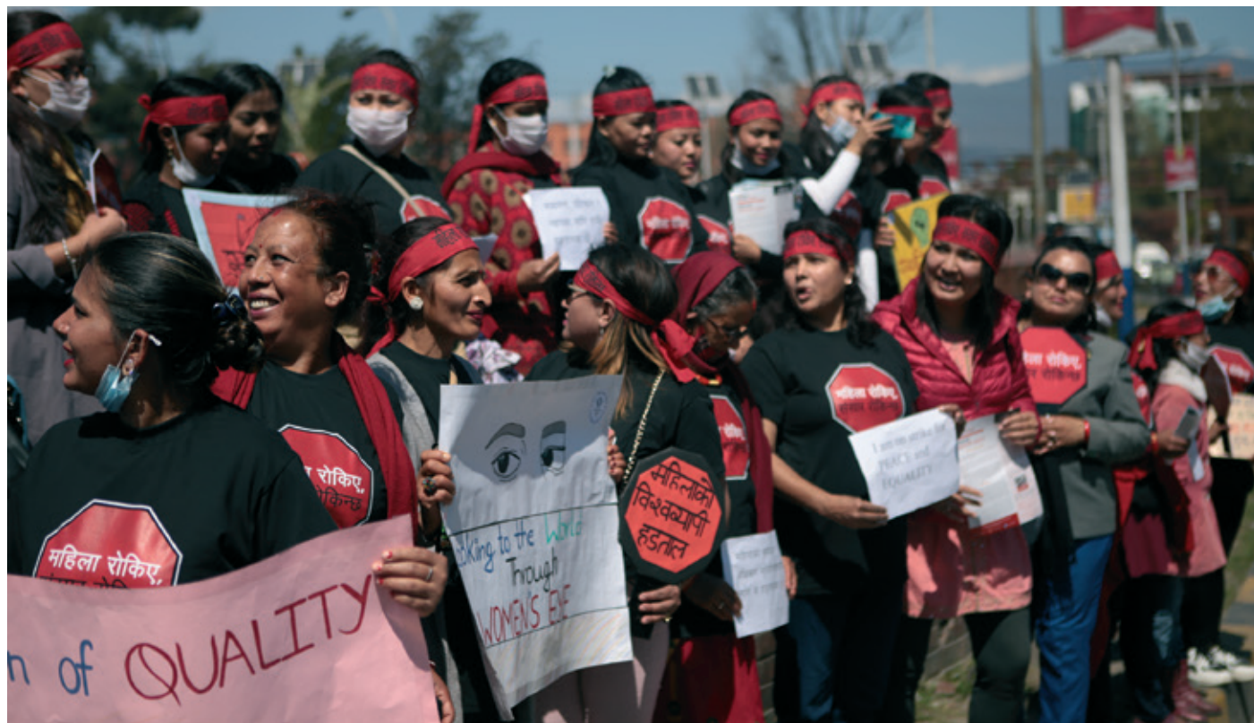
Women demand their rights: demonstration on 8 March 2020, the international women's day, in Kathmandu.