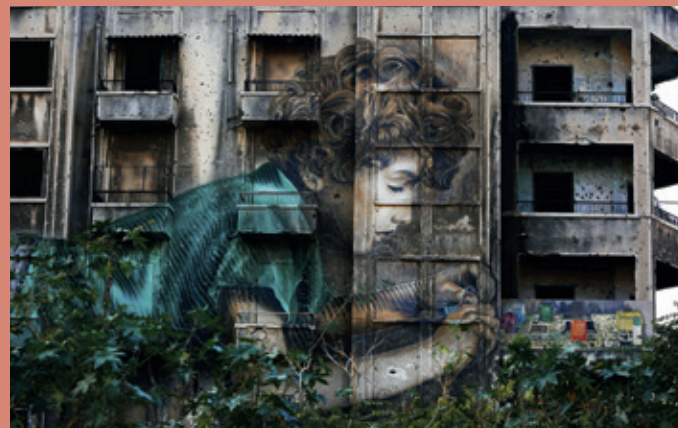
Graffiti on a bullet-riddled building on the former frontline of the Lebanese civil war in downtown Beirut (photo taken in 2018).