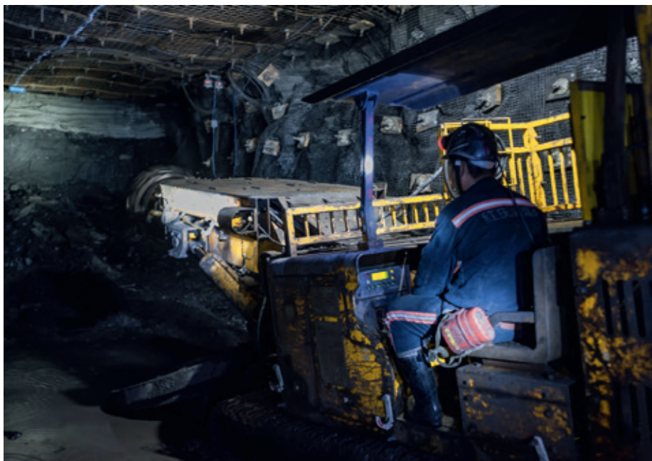
China's government promises to accelerate transition to renewables. Worker in a coal mine in Inner Mongolia.

In any case, the IEA deserves praise for promoting the clean energy agenda. A decade ago, it still had a reputation for promoting fossil fuels and underplaying the