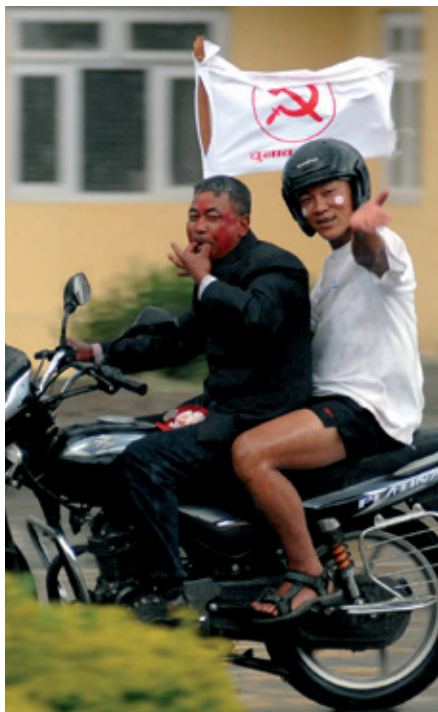
After the end of the civil war, the Communist Party of Nepal won the elections. Supporters celebrate the victory in April 2008.

her consent and with a girl under the age of 18 with her consent". The definition of sexual relations was broadened to include sexual intercourse, oral intercourse and penetration with objects, rather than simply intercourse, as was the case in the past. In addition, the statute of limitations for reporting a rape was lengthened from 35 days