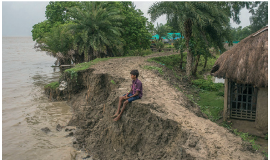
Threatened environment: eroding shoreline of a Sundarban island in the Ganges Delta.

During a short stay in Venice, the bookseller meets the illegal immigrant by coincidence. They know one another from a dramatic encounter in the Ganges Delta which culminated in a person being bitten by a cobra and only barely surviving.