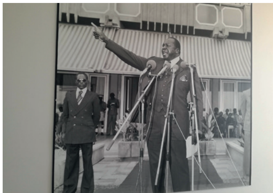
In the exhibition at the Uganda National Museum in Kampala: dictator Idi Amin during a public appearance.

The exhibition ran until mid-February 2020 in Kampala and is scheduled to move on to many more venues.