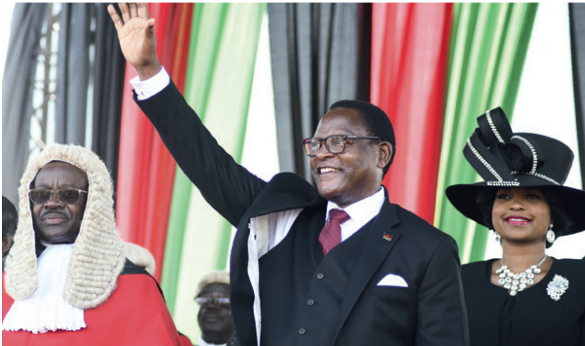
Lazarus Chakwera immediately after the swearing-in ceremony.