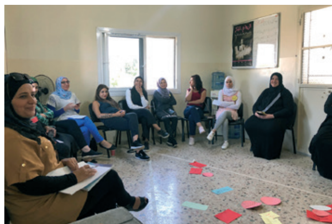
Non-violent communication workshop at the women’s cooperation Nisaa Kaderat (Capable Women).

Another focus of forumZFD aims at encouraging community activism across divides to mobilise for nonviolent action. Together with its partner, The Lebanese Women Democratic Gathering, forumZFD supported the foundation of a women’s cooperation Nisaa Kaderat (Capable Women) with Syrian and Lebanese peace activists. Nisaa Kaderat opened a self-organised community centre that provides a safe space for women of all nationalities and generations in the city of Baalbek. It invites women to find shelter and relief from