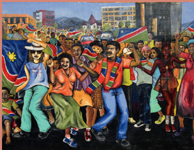
A mural in Windhoek depicts the celebration of independence in 1990.

There is more bad news. Many of the non-privileged resettlement beneficiaries cannot make a living from the land. Lacking capital and know-how, they depend on state aid. hm