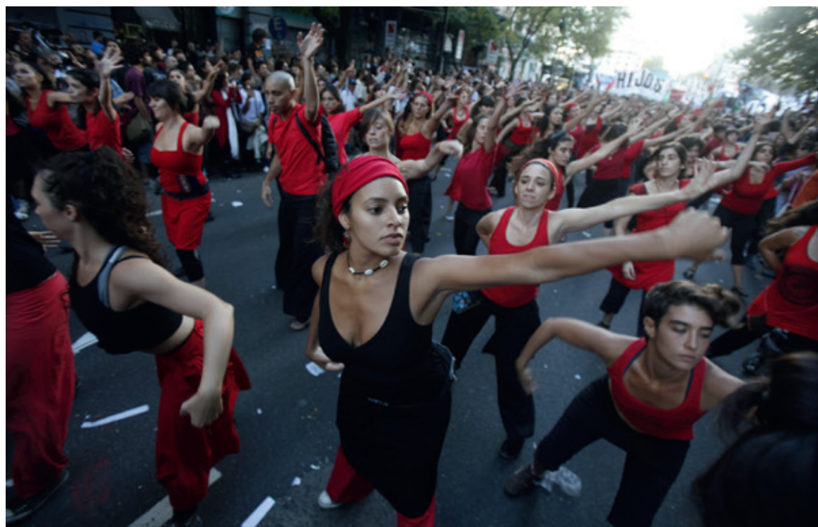
In March 2011, activists of H.I.J.O.S remind in Buenos Aires of all the people who disappeared during the military dictatorship in Argentina.