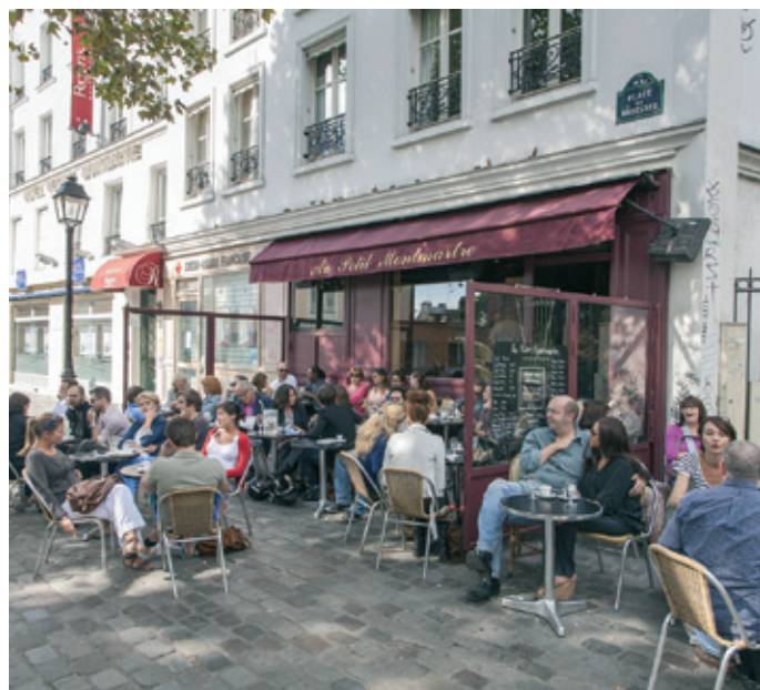
A café on the Place des Abesses, similar to many cafés where Parisians enjoyed their evening on 13 November 2015.

Cheering and celebrating people fill the streets of Paris. Football fans stream into the Stade de France under the watchful eyes of security forces. People sit in bars and cafés, enjoying their evening. Meanwhile,