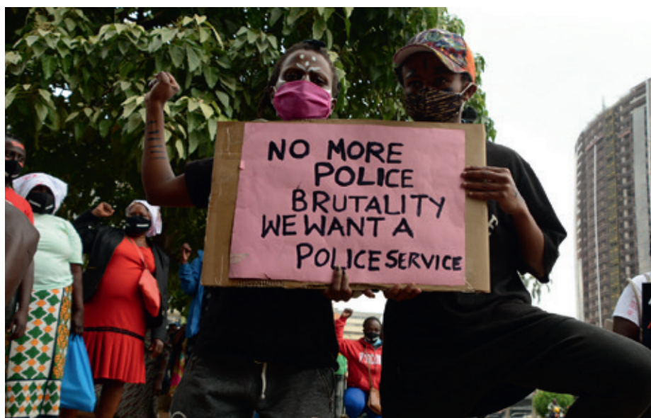
Nairobians protesting against police violence.

Police brutality is worse in the USA than in Europe, but things are still worse in many developing countries. By early June, according to official data, the Kenyan police had killed 15 people when enforcing lockdown rules. A Kenyan colleague tells me that tribal resentments did not play a role, but that the police’s brutal anti-poor bias has not changed since colonial times. Either way, I found photos of Nairobi protesters depressing. They adopted the symbolism of BLM, taking a knee and raising their fists. Though Trump certainly does not appreciate it, civil-society activism in the USA is leading the world.