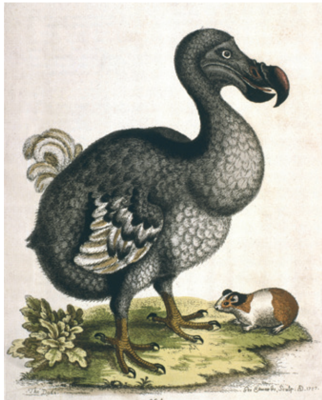
The extinct dodo is the national animal of Mauritius and a symbol of a lost paradise.

It is obvious that Le Clézio’s personal history played a big role in the creation of the novel. The 80-year-old author, who won the Nobel Prize for literature in 2008, has his own family roots in Mauritius. He lived there for a time as a child and is a citizen of both France and the island nation. He visits Mauritius regularly, and several of his novels and stories take place there. Travel