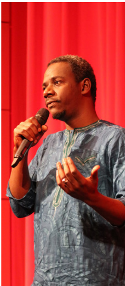
Film director Mamadou Dia speaking to an audience at Frankfurt’s Film Museum.

The two fathers are unaware of these modernist winds blowing through their own homes. They are focused on their struggles