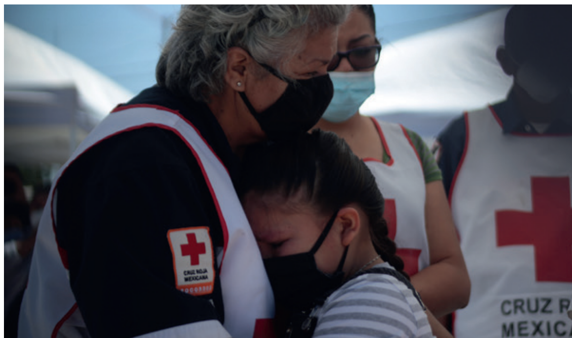
Mexico needs its care workers: Red Cross nurse grieving at the funeral of a colleague who died of Covid-19.

One consequence of the current policy is that migrant care workers – most of them women working with temporary permits – tend to labour in difficult circumstances which sometimes are actually illegal. Nonetheless, they are essential workers who are supposed to keep the care system running, thereby reinforcing the illusion that German women can easily make family life and professional careers compatible.