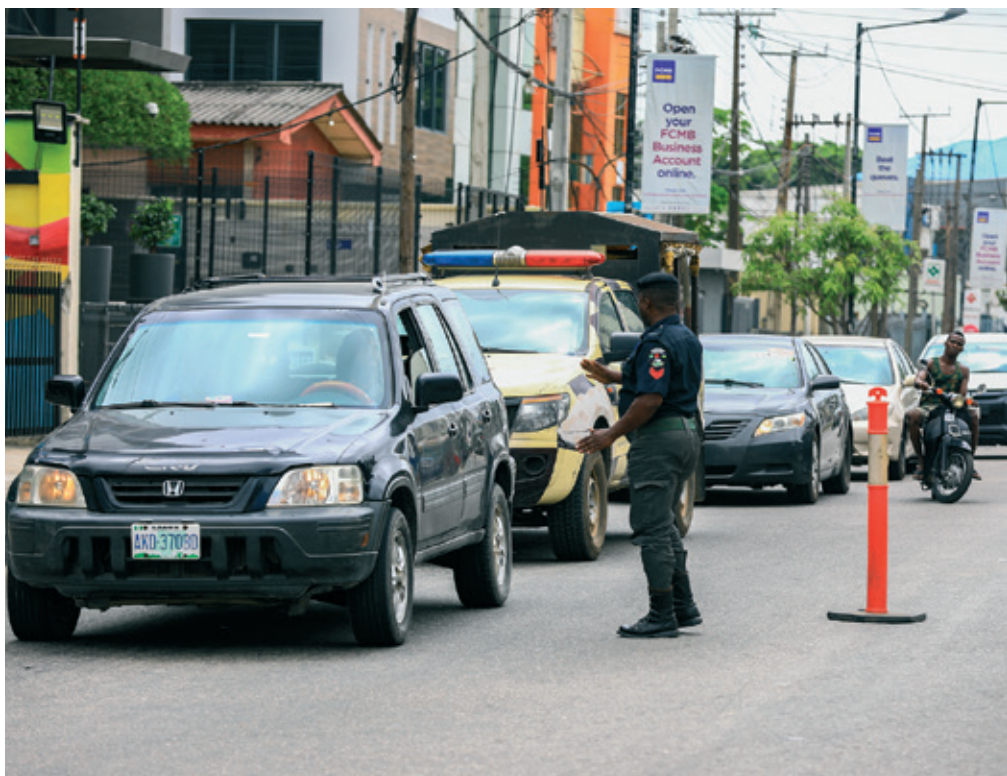
The novel “My Sister, the Serial Killer” does not show the Nigerian police in a good light.

Oyinkan Braithwaite was born in Lagos in 1988 and spent her childhood in Nigeria and Britain. She studied law and creative writing in Surrey and London and has lived in Lagos since 2012. On the background to her book, Braithwaite told the British daily The Guardian that she almost failed in her ambitions. She had set out to write a great novel but found herself blocked. Around her 30 th birthday, she finally gave up. As The Guardian reports, she told herself “Just