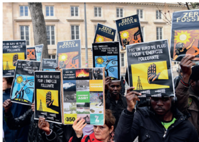
Demonstration against the financing of fossil fuels in France in 2019.