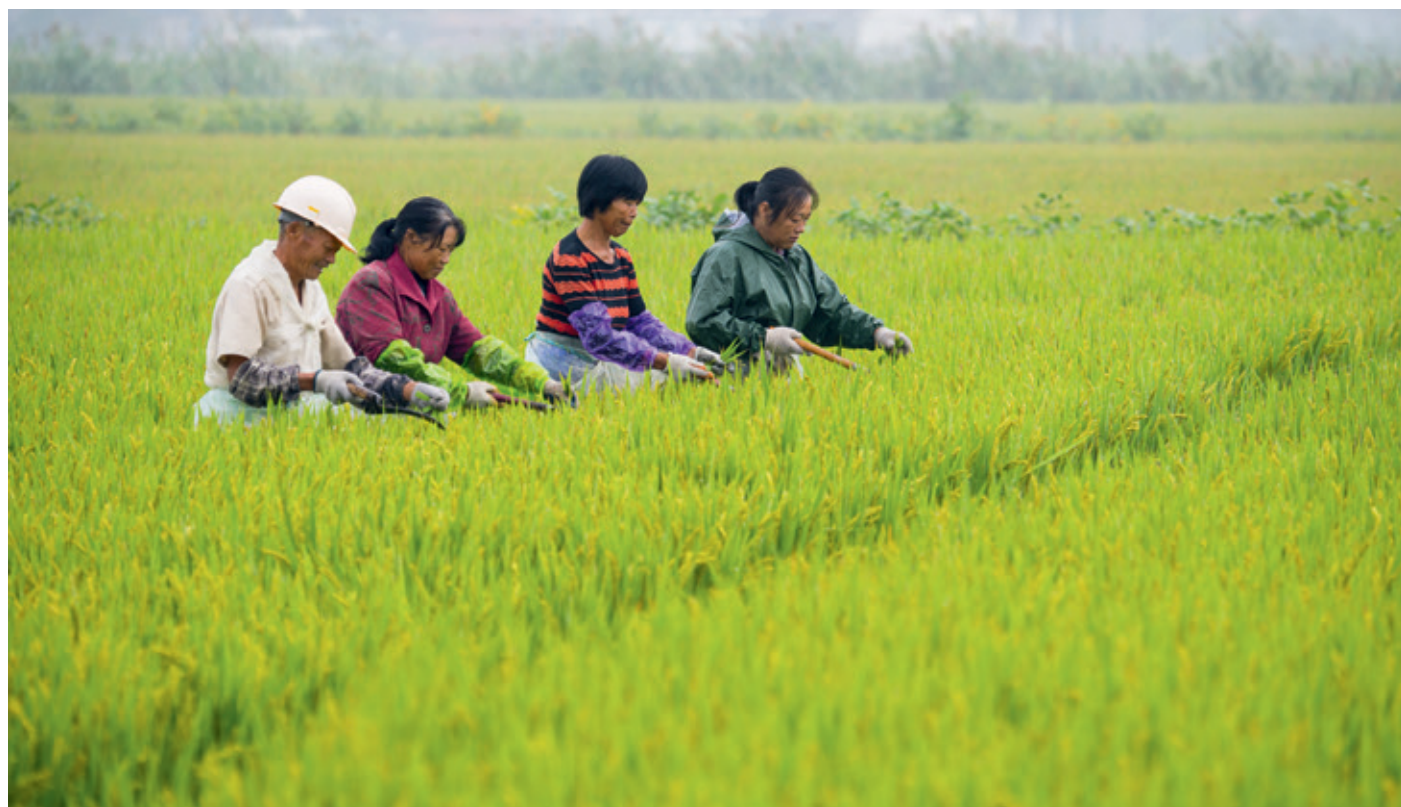
By 2018, agriculture only accounted for a little more than a quarter of the labour force in China.