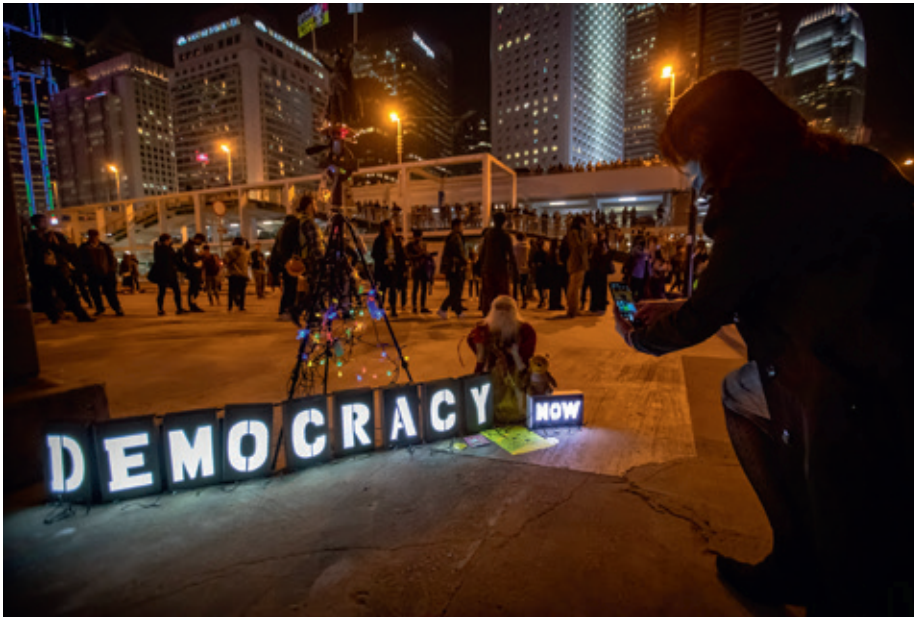
Hong Kongers have been rallying for civic liberties for many months.