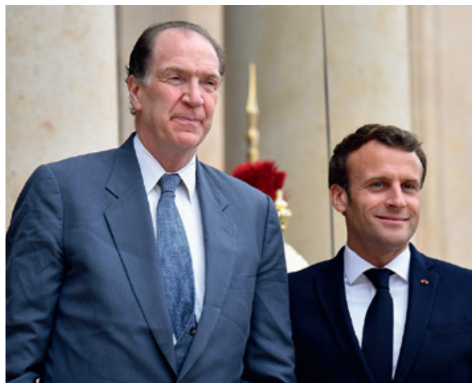
David Malpass, the World Bank president, and French President Emmanuel Macron have spoken out in favour of debt leniency. This picture was taken in May 2019 in Paris.