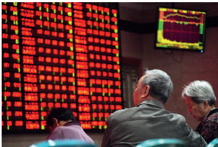
Chinese stock ratings: well-functioning capital markets require a minimum level of rule of law.

Western scholars tend to under-appreciate that more functional differentiation may cause disintegration. That is particularly true where social diversity is big to begin with – as in China or Singapore. Singapore is a multi-cultural and multi-ethnic city, so no one can take cohesion for granted. On the other hand, paternalism disempowers people and can obscure existing tensions. It was quite telling that Singapore largely managed to contain the Covid-19 pandemic, but then the virus started to spread fast in migrant workers' shelters. The government's idea of the common good had only taken account of its citizens. We can observe something similar in the EU. This alliance of democracies has a pattern of generally endorsing human