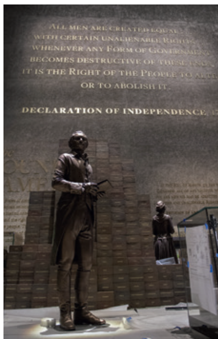
A slave owner and democratic revolutionary: the Smithsonian Museum in Washington displays statues of Thomas Jefferson and slaves, separated by a wall.

I agree, but we will be accused of being Euro-centric if we refer to European enlightenment. It is unfortunately true that Voltaire, the important proponent of enlightenment philosophy, benefited from the slave trade. Yes, and Thomas Jefferson and other founding fathers of the USA were slave owners.