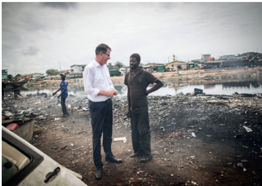
Minister Gerd Müller visiting a waste disposal site in Accra, Ghana.