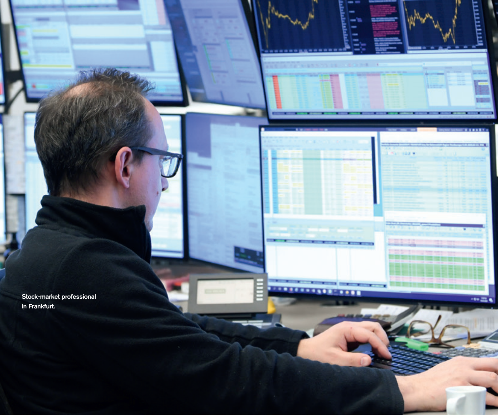
Stock-market professional in Frankfurt.

This focus section directly pertains to all of the UN's 17 Sustainable Development Goals (SDGs).