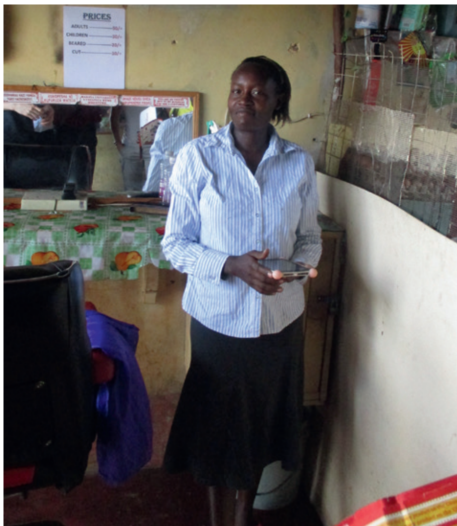
Kenyan regional online shop Copia delivers customers' orders for collection at existing local stores like this one in the Nairobi region.

Also particularly important at present are finance and support for innovative companies engaged in expanding new technologies and, above all, digital networks. Those industries have been drivers of development in Asia and Africa for the past 10 to