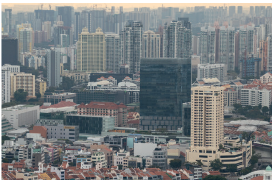
Private condominiums and public housing projects side by side in Singapore.

There are other examples of successful authoritarian development regimes. Consider Singapore, where I have done substantial research over the years and lived for some time. This city state is much smaller than China, of course. It calls itself a one-party democracy, and it has laid the foundations for impressive economic growth. Yet, market enthusiasts tend to overlook the fact that Singapore does not simply allow market forces free reign. The government redistributes wealth with determination. It has built strong, well-functioning and performing education and health-care systems. It ensures that there is enough affordable housing, attracts 'foreign talents' and strategically builds up economic sectors of future global relevance, such as biotechnology or creative industries. The rule of law is in force. Professional careers and personal status depend on merit, formal education and personal achievement. Markets must be in