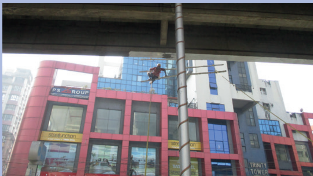
India's workers would benefit from a law like China's labour code: construction worker in Kolkata.

China's repression of Muslim Uighurs is unacceptable, but India's treatment of Muslim Kashmiris is awful too. Dozens of people died in Indian pro-democracy protests and anti-Muslim riots in recent months. By mid-September, the repression of Hong Kong's pro-democracy movement had not lead to comparable bloodshed there. India's relatively free press means there is generally more information about abusive government action than in mainland China - and probably henceforth in Hong Kong too. pj