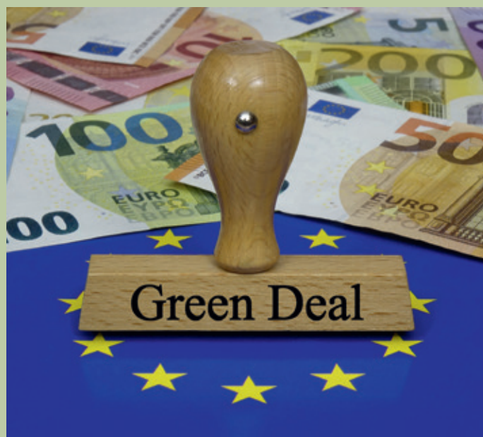
Significant sustainable investment is needed to turn the Green Deal into reality.

the EU’s economy sustainable – in its “Roadmap for Recovery” (EC, 2020b). The Green Deal includes a growth strategy designed to create a low-carbon economy.