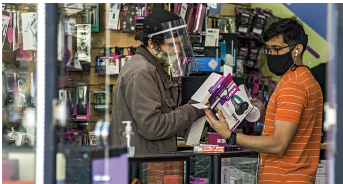
Covid-19 is exacerbating economic problems: small retail shop in Buenos Aires in late August.