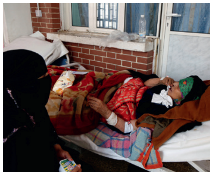
Cholera patient in Yemen, the country hit by multiple crises.

At the same time, we must bear in mind that the pandemic has considerably worsened pre-existing humanitarian crises in some conflict regions. In recent years and decades, progress was made in regard to fighting poverty and hunger as well as im-