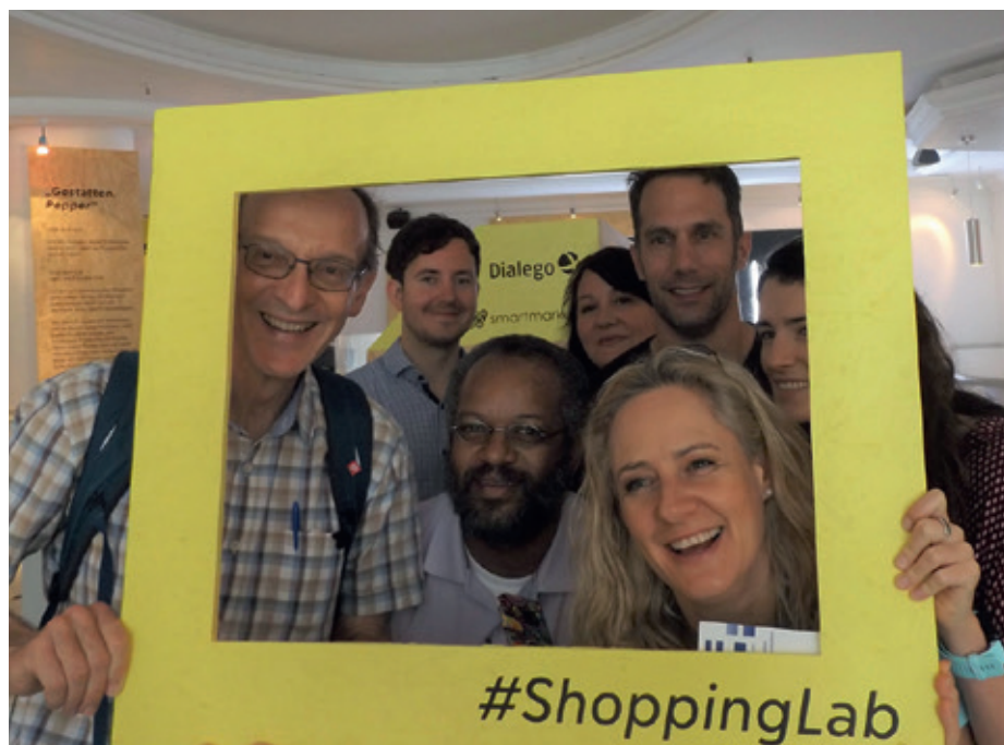
Aachen and Cape Town municipality staff participating in the exchange project.

a deeper understanding of the importance of cross-cutting tasks.