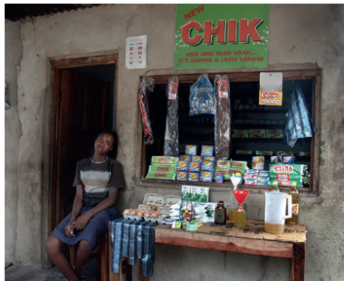
Small shop in pre-pandemic Mungu, Zambia.

Some consider her lucky. Her work is essential and can go on. By contrast, restaurants and bars have had to close. The