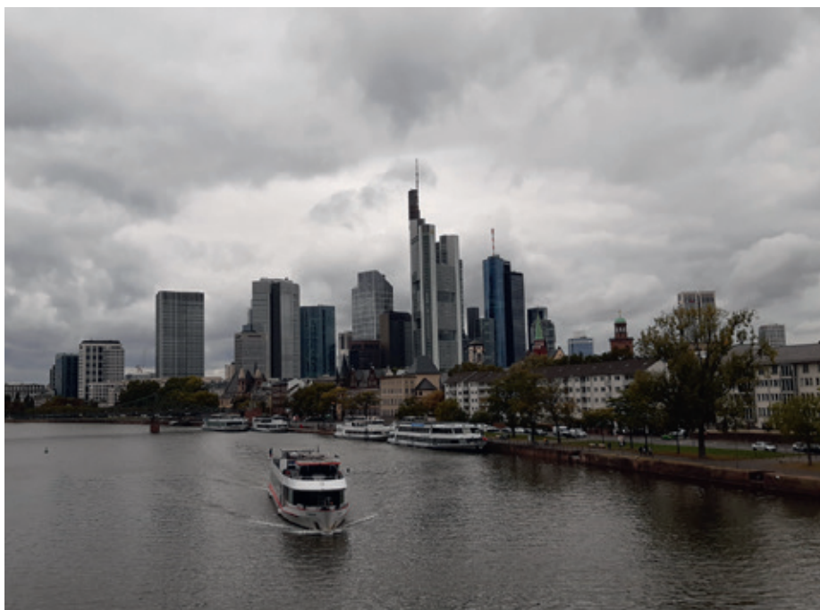
"Money laundering in prosperous financial centres is compounding the fiscal problems of developing countries." Frankfurt skyline.

consider which tax breaks and subsidies they can cut. Reducing them will increase their fiscal space. They should also do whatever they can to curtail illicit financial flows. Huge amounts of money are flowing from low-income countries to prosperous nations because of corruption, tax evasion and various illegal and non-legitimate activities. The governments of developing countries must get a grip on the matter, and so must those of rich nations. Never forget that money laundering in prosperous financial centres is compounding the fiscal problems of developing countries. Moreover, some companies are profiting from the Covid-19 crisis, espe-