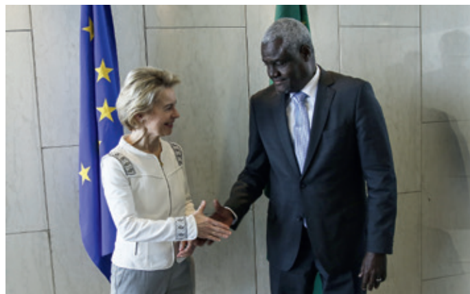
EU Commission President Ursula von der Leyen and the chairperson of the African Union Commission, Moussa Faki Mahamat, at a meeting in February in Ethiopia.