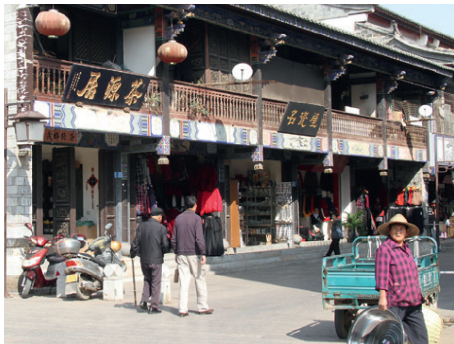
China is expected to become a high-income country soon: shops in Jianshui in Yunnan Province.

forming international cooperation“ and it is the result of a GIZ research project.