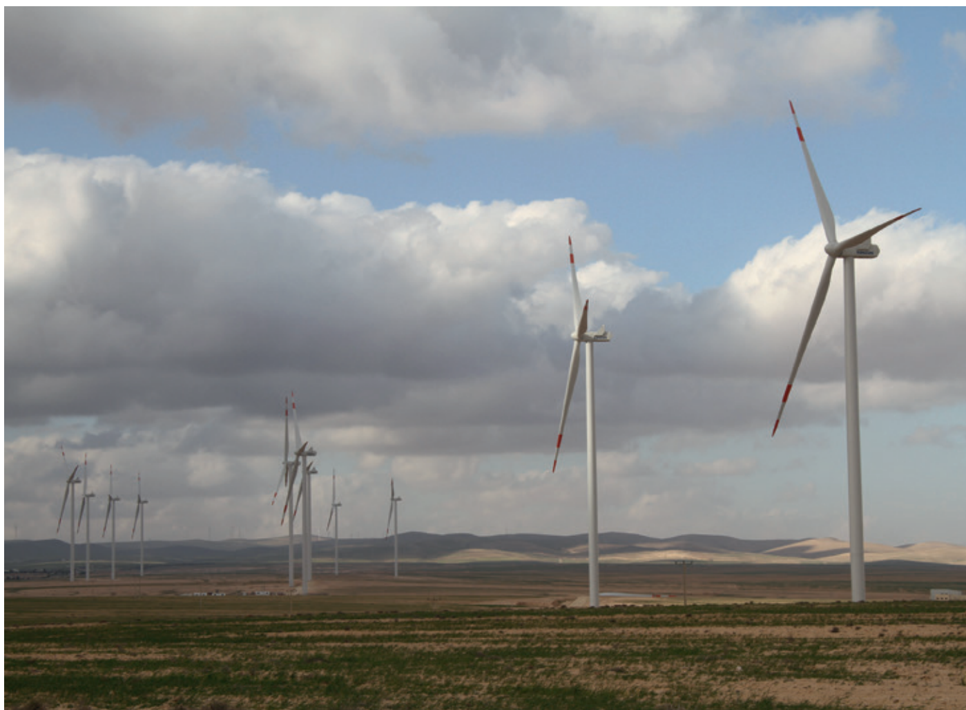
Criteria determine when an investment is “green”. Wind farm in Jordan.

standards for green bonds. These include the ASEAN Green Bond Standard, the EU Green Bond Standard and the standards of the Climate Bond Initiative.