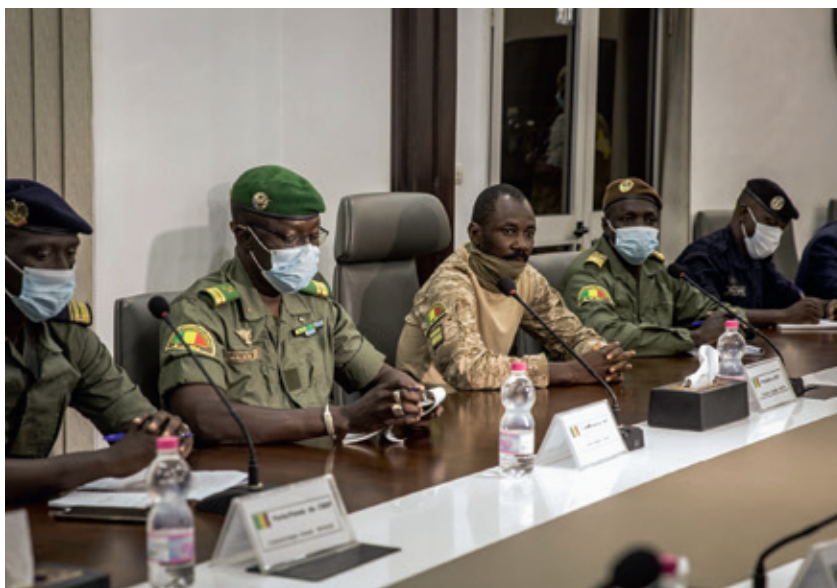
The military under Colonel Assimi Goita (centre) has taken over the government in Mali.